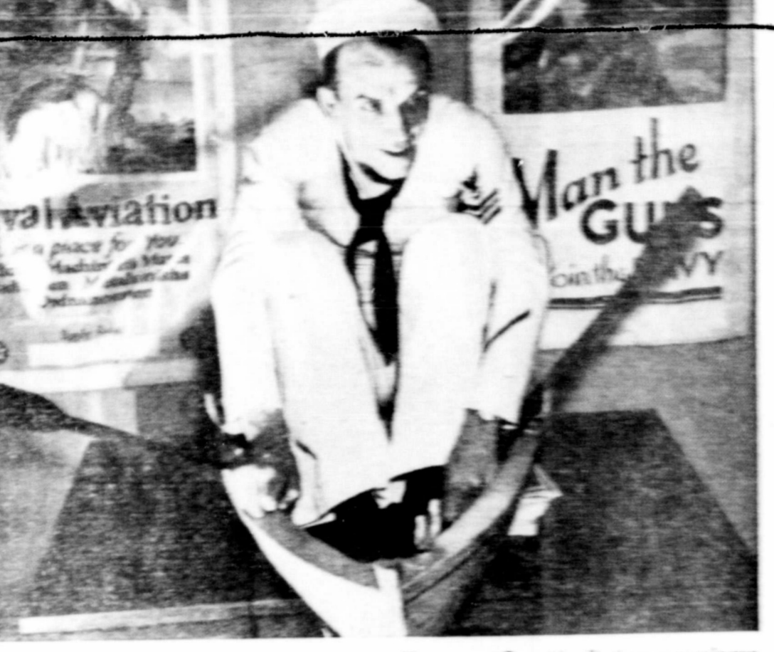
Man the pumps, mates! Navy has room for more...