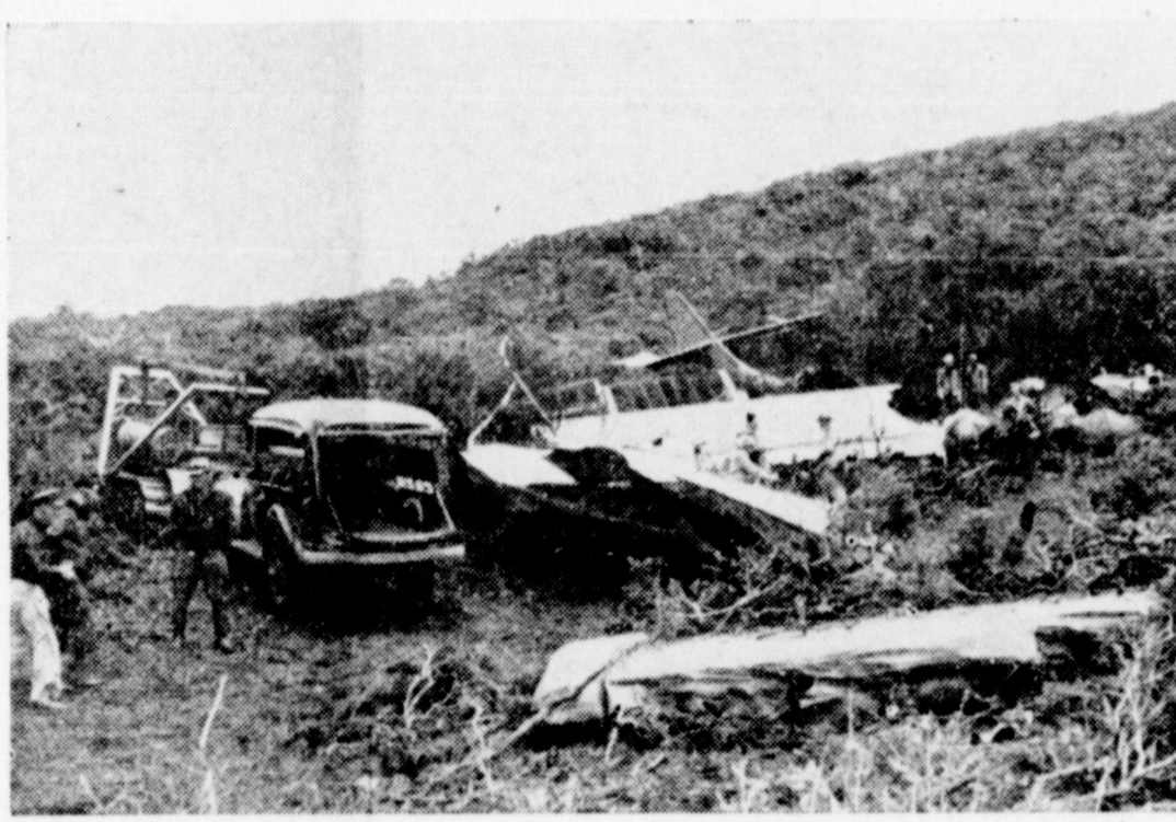
SCENE OF NAVY PLANE CRASH—Six men were killed and one injured in crash of this big two-motored PBV Navy Patrol bomber near San Francisco. Rescue workers seek bodies in wreckage while officials examine vital parts of ship in attempt to determine cause of the crash.