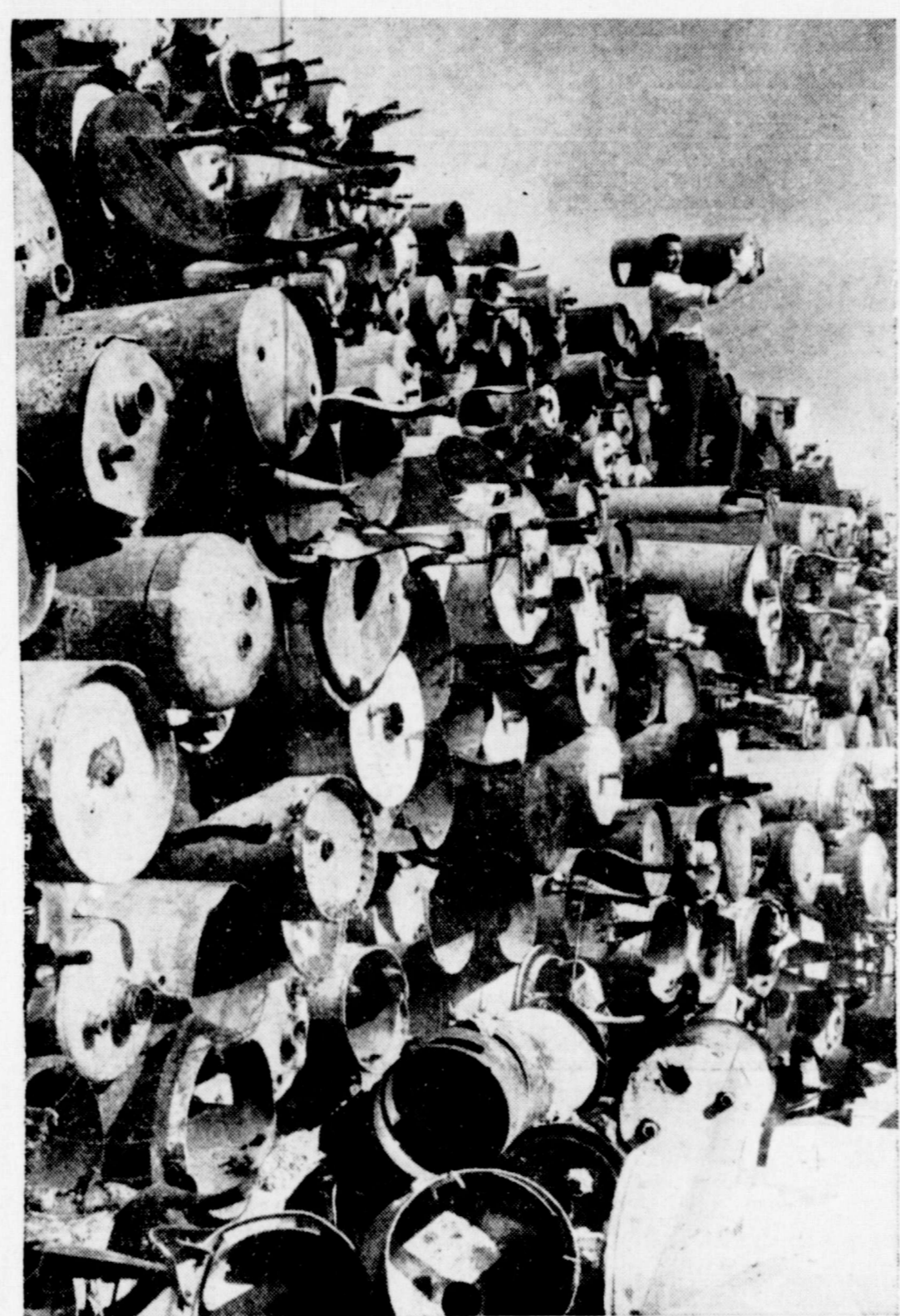
U. S. SCRAP FOR JAPAN—Yep! Japan is destined as the recipient of these thousands of junked hot water tanks pictured in Los Angeles junk yard, but they'll bring no joy to any Nipponese heart because they will be delivered in the form of munitions shot up by U. S. forces. Before the war the Japs bought all of our old scrap metal they could.