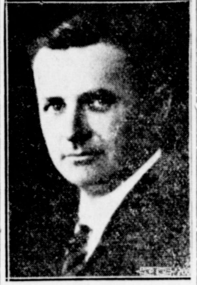
JAMES V. ALLRED, 41 years of age, has spent most of his life in public office. He served as attorney general of Texas two terms, two terms as governor and was then appointed to a federal judgeship. He quit the life-time federal court job yesterday to ask that he be elected U. S. senator in place of W. Lee O'Daniel.