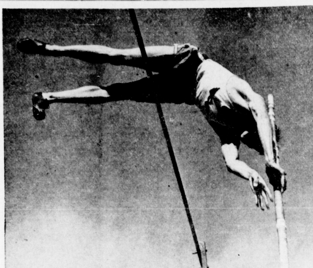
RECORD VAULT —The perennial record breaker, Cornelius Warmerdam, does the "impossible" again as he soars over the bar at 15 feet 6 7-8 inches at Berkeley, Calif., to break his own unofficial world mark in the Pacific Association track meet. His former record mark was 15 feet 3 3-4 inches.

Good beef cows turned at $8.50 to $9.25 with one load at $9. Plain and medium butcher cows brought $7.50 to $8.25 and canners and