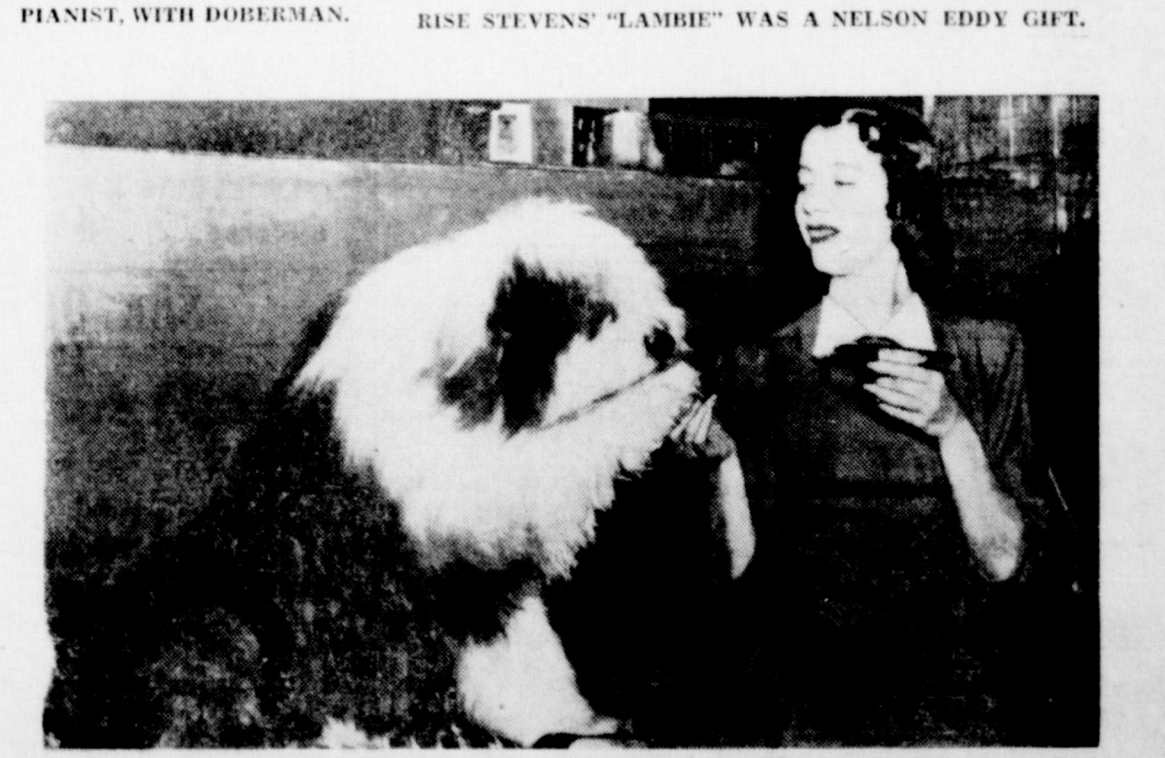
LILY PONS HONORS WITH HER SIBERIAN SHEEPDOG AT HOME.

Vertical text on the left margin: 1942, e Works, caring for, CITY, fill Work, Timber, nsulation, e It, ER CO.