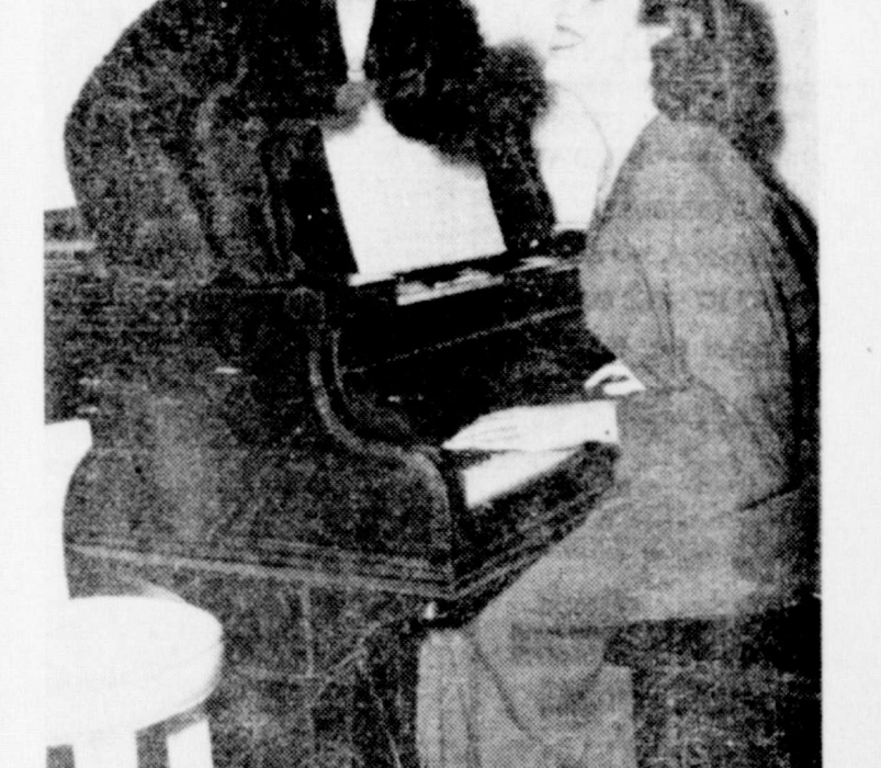
RISE STEVENS' "LAMBIE" WAS A NELSON EDDY GIFT.