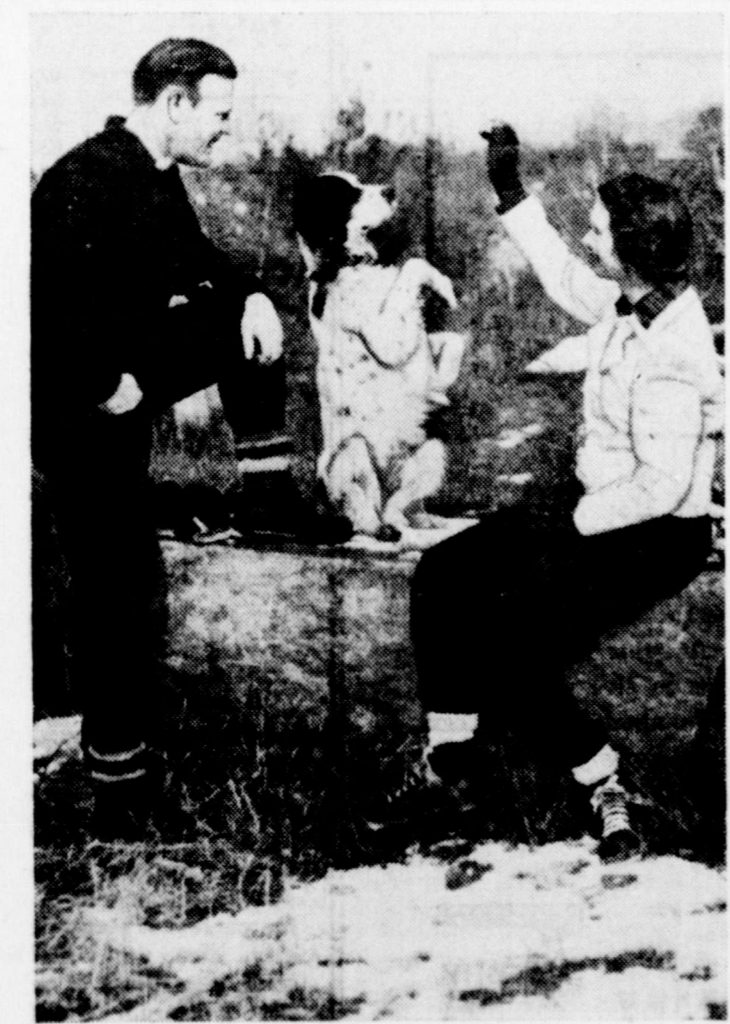
A STAR SIDESTEPS—Posing for the camera is nothing new for Red Rolfe, star New York Yankee third baseman, so he takes a back seat for the moment as his dog "Joe" goes through his paces as wife doles out a cracker.