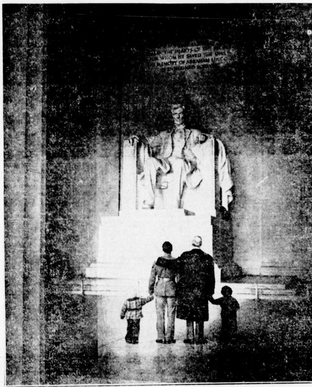
THE VOICE OF LINCOLN DOWN THE AGES--"I always feel inclined, when I happen to say anything to soldiers, to impress upon them the importance of success in this contest. It is not merely for today, but for all time to come, that we should perpetuate for our children's children that great and free government which we have enjoyed all our lives. . . . Still, let us not be over sanguine of a speedy, final triumph. Let us diligently apply the means, never doubting that a just God, in His own good time, will give us the rightful result."