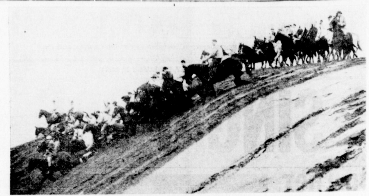
AMERICA'S "MOUNTIES"—Mounted troopers of California State Guard, only mounted unit in the home defense organization...

Sheep were steady although bulk of the supply was unsold on early rounds. Good to choice fed steers and yearling cattle held still higher. Load lots of steer yearlings cashed at $11 and $11.50. Common and medium steers and yearlings cashed at $7 to $10 with one load of fat Mexican steers at $9.25 and three loads of steers at $10.