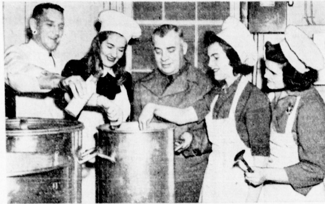
HOW TO COOK CHOW—Students taking home economics course at Centenary College, Hacketts-town, N. J., get a few pointers in the art of preparing army chow on visit to Governor's Island, in New York harbor. Sergeant and chef instruct trio of students in cooking some pea soup.

The regulations specify that airports have regular airport managers, 24-hour guard service, registers for accurate checks on all flights, and enforce rules that all pilots present proper identification before clearing the field.