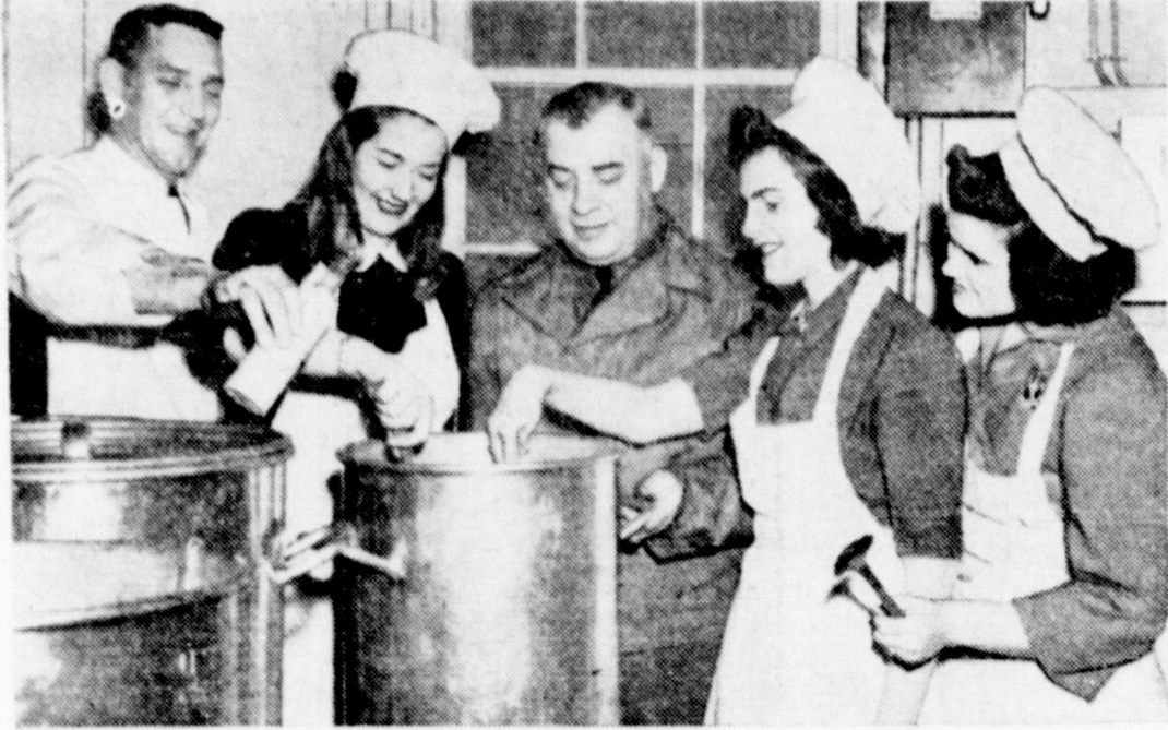
HOW TO COOK CHOW—Students taking home economics course at Centenary College, Hackettstown, N. J., get a few pointers in the art of preparing army chow on visit to Governor's Island, in New York harbor. Sergeant and chef instruct trio of students in cooking some pea soup.

The regulations specify that airports have regular airport managers, 24-hour guard service, registers for accurate checks on all flights, and enforce rules that all pilots present proper identification before clearing the field.