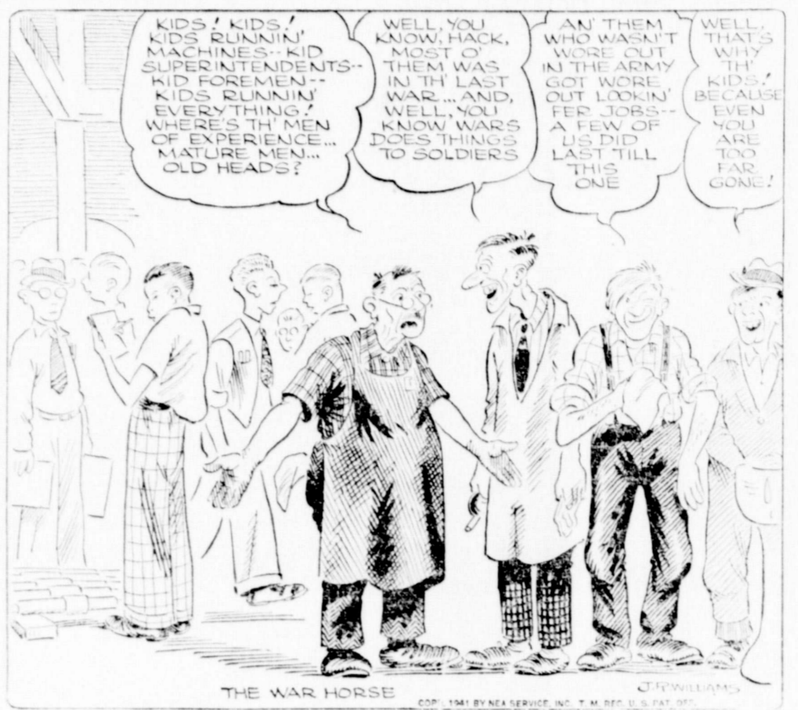
THE WAR HORSE.

This is mixed with Red Squall or other poison. The Scranton club consists of 45 members.