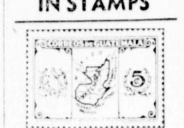
Beauty of Guatemala Draws Many Tourists.

GUATEMALA, which borders Mexico on the south, is one of the most picturesque of the Latin American countries. There are Indian villages, ancient churches, relics of the conquistadores, roadside shrines and Mayan ruins.