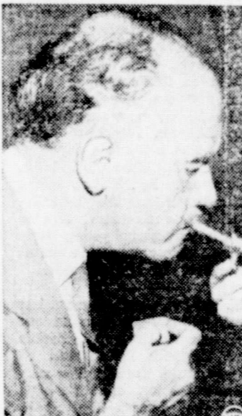
Gaston Henry-Haye, French ambassador to U. S., pauses for a light after enlightening reporters that "collaboration" with Nazis didn't mean Vichy would turn over bases of French fleet.