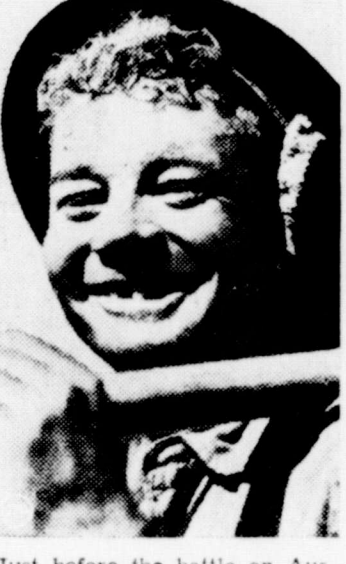
Just before the battle an Australian "digger" wore this smile, anticipating the British victory in Syria.

8 EASTLAND COUNTY CITIZENS ON COMMITTEE TO ASSIST IN FARM REHABILITATION WORK