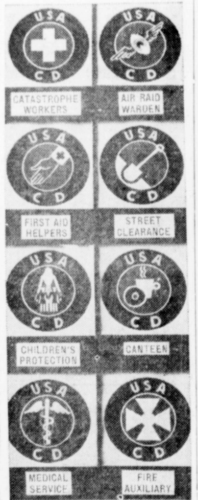
Badges like these will brighten uniforms of U. S. civilian defense workers.