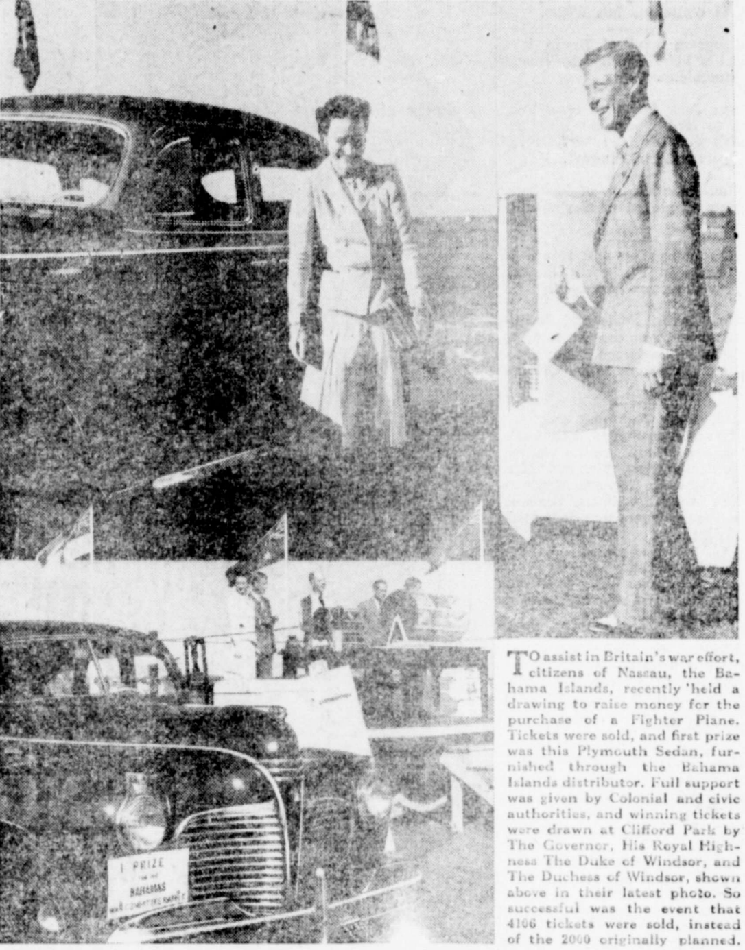
To assist in Britain's war effort, citizens of Nassau, the Bahama Islands, recently held a drawing to raise money for the purchase of a Fighter Plane. Tickets were sold, and first prize was this Plymouth Sedan, furnished through the Bahama Islands distributor. Full support was given by Colonial and civic authorities, and winning tickets were drawn at Clifford Park by The Governor, His Royal Highness The Duke of Windsor, and The Duchess of Windsor, shown above in their latest photo. So successful was the event that 4100 tickets were sold, instead of the 2000 originally planned.