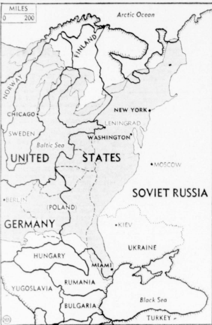
Map shows how Russo-German battlefront would look superimposed on U. S. eastern seaboard. Florida would hit on Rumanian-Russian frontier, Maine even with northernmost Finnish-Russian boundary.