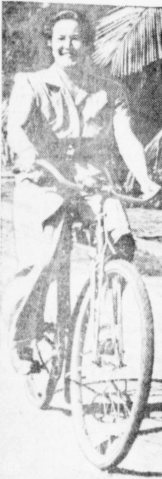
Gertrude Ederle usually is associated with bathing suit, but here first woman to swim English Channel enjoys bicycle ride while vacationing in San Juan, Puerto Rico.