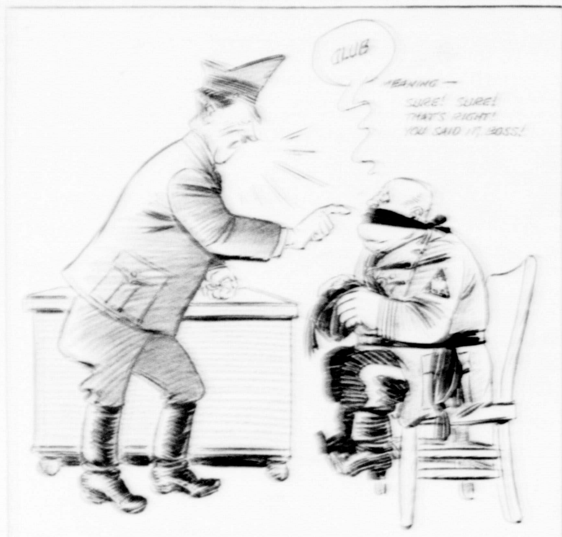
The conversations were conducted in a spirit of cordial amity and were concluded with complete agreement on all points. — AXIS ANNOUNCEMENT

Hitler and Mussolini... The conversations were conducted in a spirit of cordial amity and were concluded with complete agreement on all points.