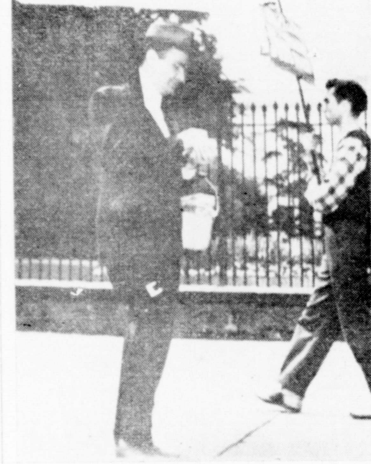
Representative Luther Patrick, (D-Ala.), peels potatoes while picketing American Peace Mobilization pickets who have been maintaining a "perpetual vigil" in front of White House in Washington for several weeks.

APPLAUSERS BUNDISTS REDS IF YOU KNOW HOW TO PICKET BUT DO YOU KNOW HOW TO WORK