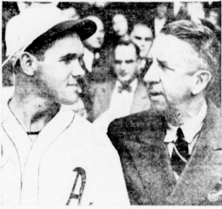
Eddie Collins, Jr., fleet outfielder of Philadelphia Athletics, discusses American League situation with famous second basing father who is general manager of Boston Red Sox.