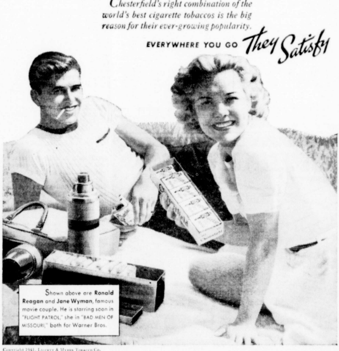
Shown above are Ronald Reagan and Jane Wyman, famous movie couple. He is starring soon in "FLIGHT PATROL," she in "BAD MEN OF MISSOURI," both for Warner Bros.

Smokers everywhere like their COOLER, MILDER, BETTER TASTE With outdoor lovers the country over, there's nothing like Chesterfield for a completely satisfying cigarette...they're always Cooler-Smoking, Definitely Milder and far Better-Tasting. Chesterfield's right combination of the world's best cigarette tobaccos is the big reason for their ever-growing popularity.