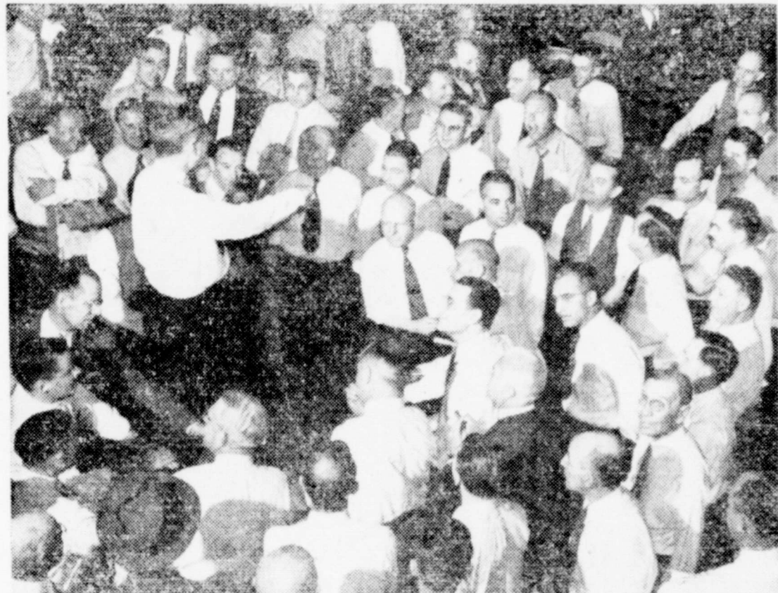
The vanguard of the 1941 winter wheat crop is auctioned off at the Kansas City, Mo., grain exchange after the arrival of the first carload, sent from Walters, Oklahoma, set a two-day all-time early arrival record and sold for 55 1/2¢ per bushel.