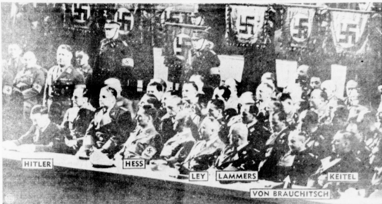
Despite German assertions that Adolf Hess has been sliding down from his lofty seat among the Brown Shirts hierarchy, the number 3 Nazi ranked high enough when this picture was taken in Berlin last Jan. 30 to sit at the hand of Adolf Hitler. That was several notches closer than Der Fuehrer's top military men, General Field Marshals Von Brauchitsch and Keitel and Labor Minister Dr. Ley and Reichminister D. R. Lammers.