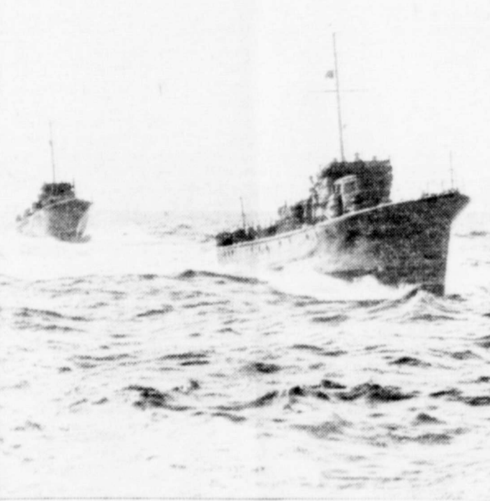
Pocket destroyers, newest British weapon to offset mounting toll in Battle of the Atlantic, cut swiftly through the water in search of German submarines. These "Huntresses of the Navy" are small motor launches, built in Britain from American parts. They carry depth charges, machine guns, anti-aircraft weapons.