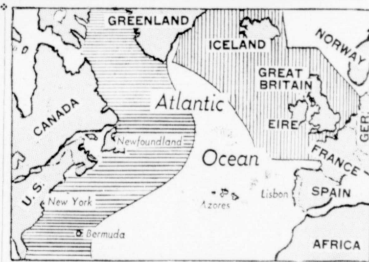
Horizontal lines indicate the U. S. Navy's new 1000-mile neutrality patrol zone in the Atlantic—one of the seven seas which, the president disclosed, the fleet will patrol "as far . . . as may be necessary for the protection of the American hemisphere." Vertical lines show the war zone Germany proclaimed last month. Note that zones are in virtual contact at Greenland, which, the president revealed, Germany may have partially occupied.

First will come the crowning of a high school student as the king, who in turn will bestow his royal