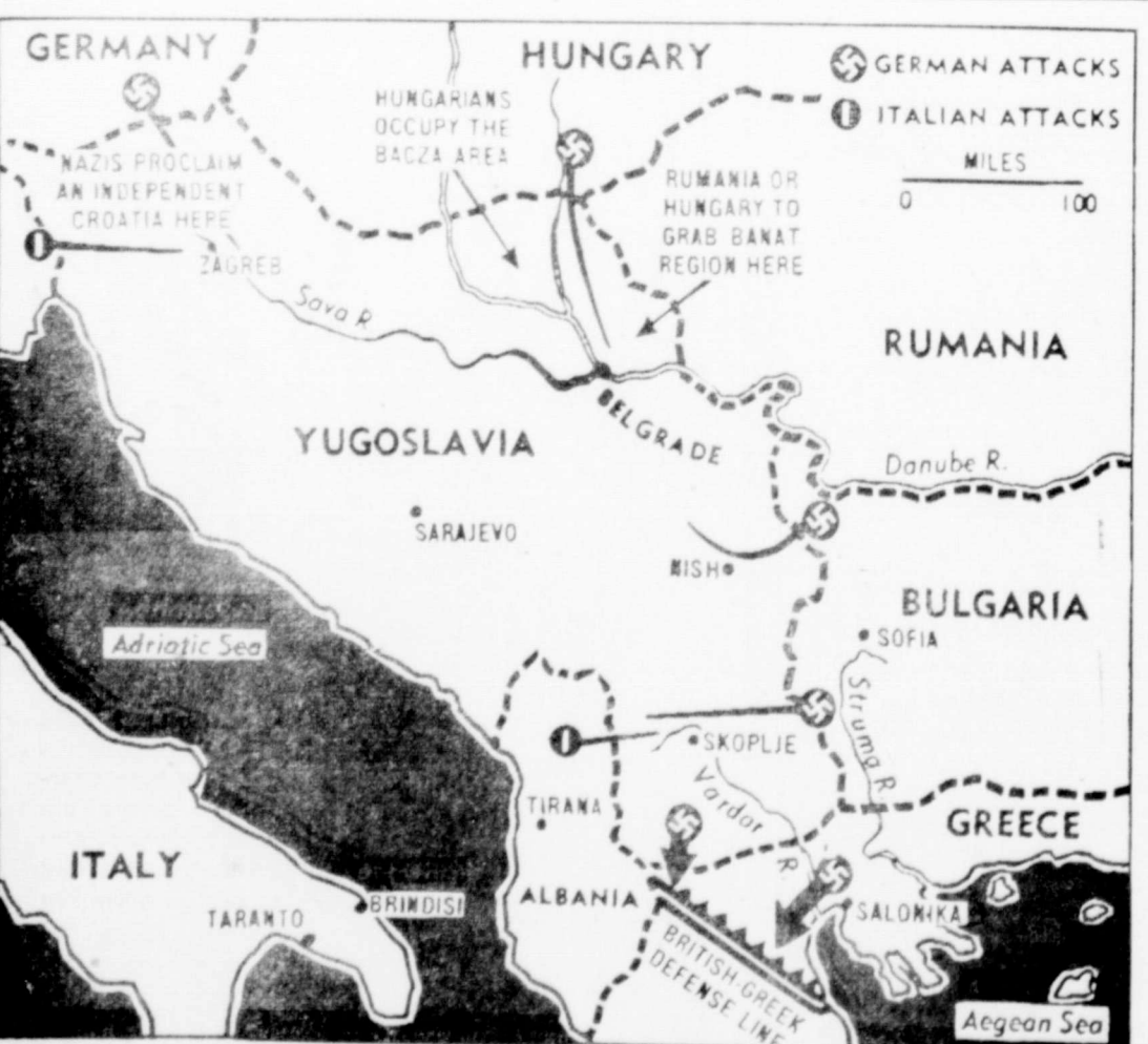
Continued German advances in Greece and Yugoslavia indicate that the entire Allied cause hinges on outcome of British-Greek defense of their lines south of Salonika.