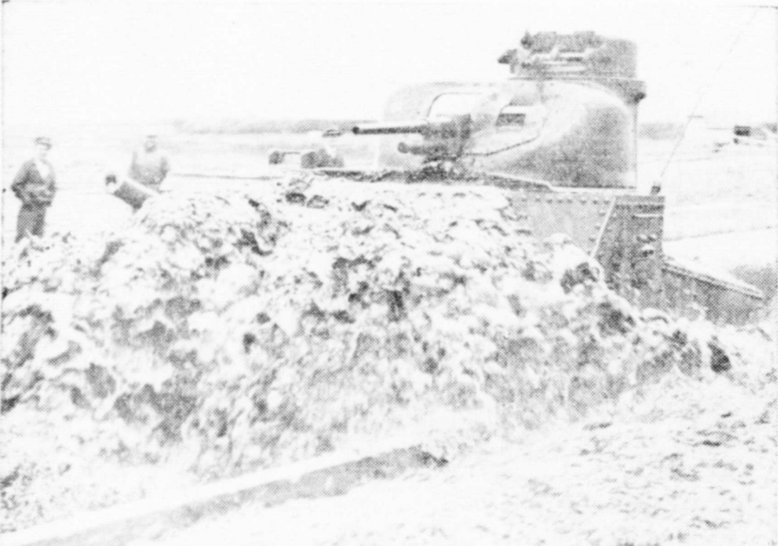
Army's new monster that roars with five machine guns and 37 mm. and 75 mm. guns plows mud and water hazard at Aberdeen, Md., proving grounds before army officers and British observers. Uncle Sam has ordered $250,000,000 of these 25-ton tanks and larger ones.