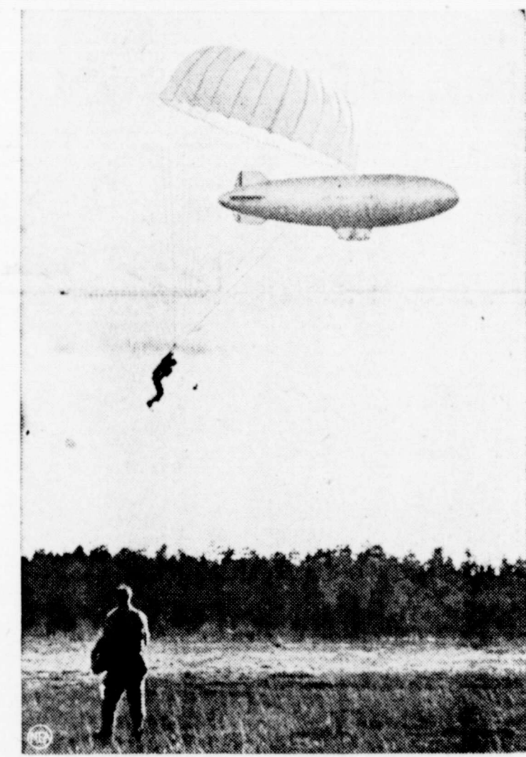
Although apparently hooking navy blimp, this parachuting marine has situation well in hand at Lakehurst, N. J. naval air base. Blimp is far enough away for a miss.