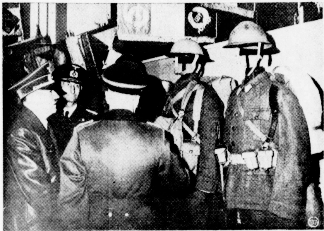
German officers proudly display captured British and Belgian uniforms to Adolf Hitler in an exhibit hall for spoils of war. The background are French flags taken in the blitzkrieg in the west.