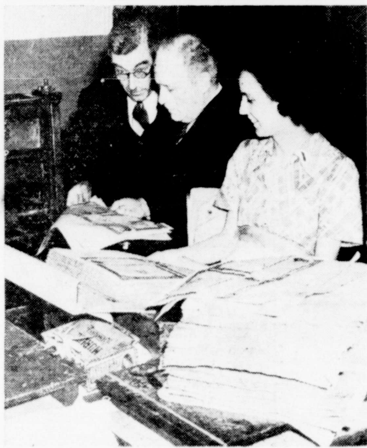
The first of the treasury department's defense financing bonds, intended to spread the cost of rearmament over as long a segment of the population as possible, are shown being examined by treasury department employees as they rolled off the presses at the Bureau of Printing and Engraving in Washington, D. C.