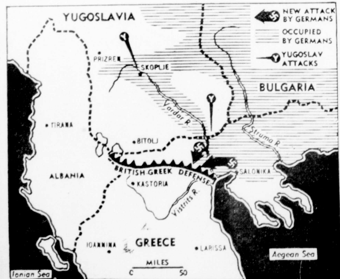
This large scale map of the Balkan war theatre sets stage for battle likely to decide outcome of German blitzkrieg in Greece and Yugoslavia.