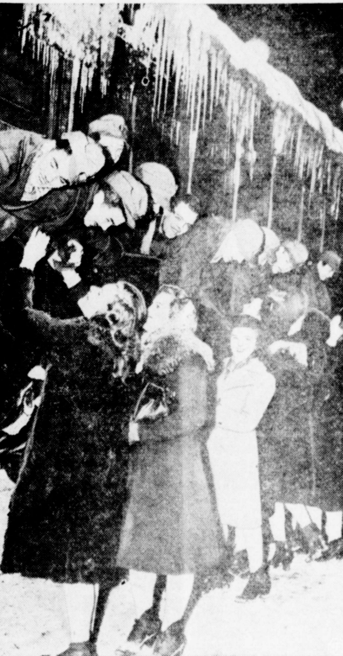
Warm sendoff by girl friends went with these lads riding feilestooned train out of Philadelphia to join the new army.