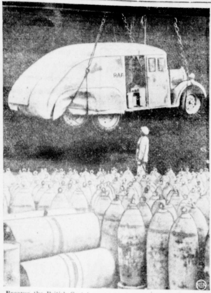
Because the British fleet has command of the Mediterranean, a continuous stream of munitions and supplies flows to British forces in Greece. Photo above, passed by British censor, shows huge bombs and a camouflaged truck, unloaded from transport at an unnamed Greek port.

reception room, honey, I'll be right back. I'll have to find out where he is ... MOST of the soldiers here, Martha guessed, were younger than Bill. All of them had the tanned, fit look Bill had acquired. The girls were carefully dressed—but she saw one girl in a bright, cheap dress and one girl, sitting in a corner with a man who seemed so different from the other girl's man, had carelessly thrown a mink coat across the back of her chair. "Democratic, all right!" Bill came back very soon. He was waving his pass and saying jubilantly: "Honey, a whole after-noon and evening, I don't have to be back until 10 o'clock!" "One whole afternoon and eve-