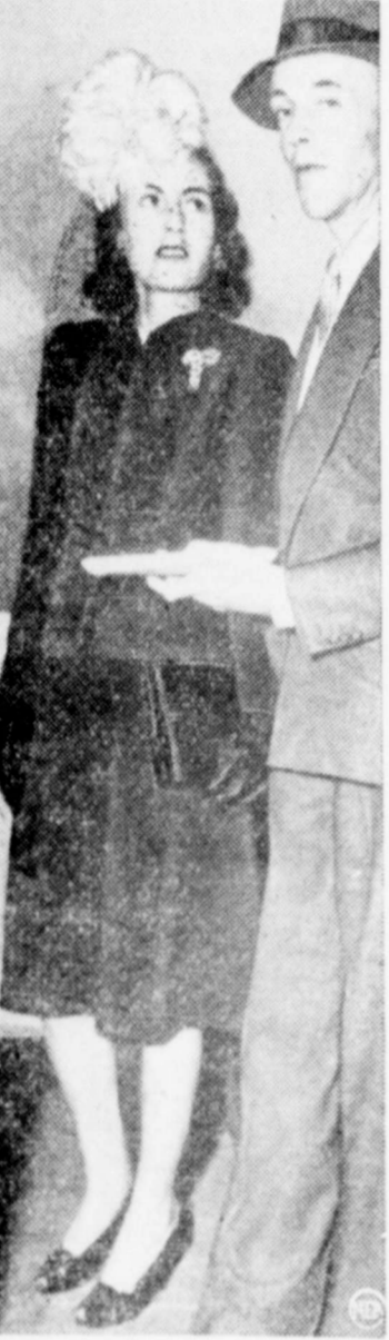
Smartest dressed of the movie colony at the races is Mrs. Fred Astaire in a collarless black wool suit with a diamond Mercury-washed pin and hat of uncurled beige ostrich tips. That's Fred with her.