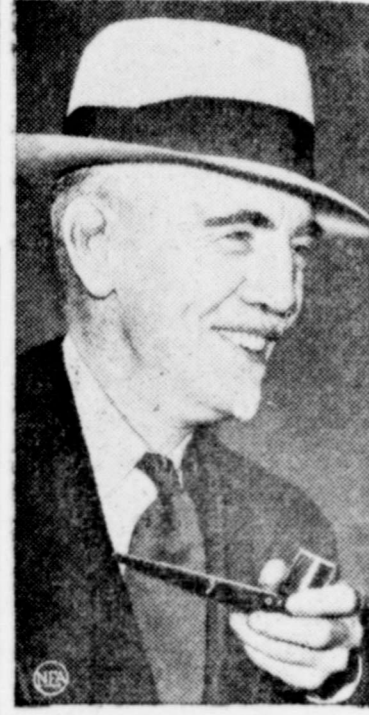
William Dudley Pelley... tries to move Silver Shirt headquarters to Indiana.