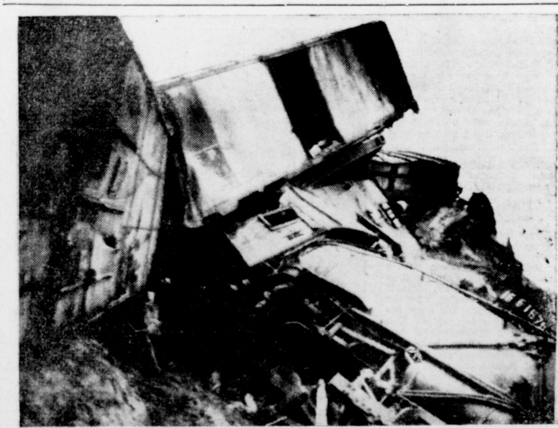
A wrecking crew digs into the wreckage of a Sante Fe freight at Del Mar, California, for the bodies of three trainmen who were killed when the engine and 17 cars slid off a 25-foot embankment onto the beach. Three of the cars fell into the ocean.