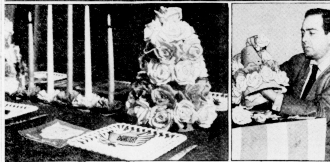
The table decorations shown above were designed by Lester Gaba, famous designer (lower right) to be used by Mrs. Franklin D. Roosevelt on January 14 when she gives the First Party in a chain of Home Parties for the benefit of the 1941 Fight Infantile Paralysis campaign at the White House.