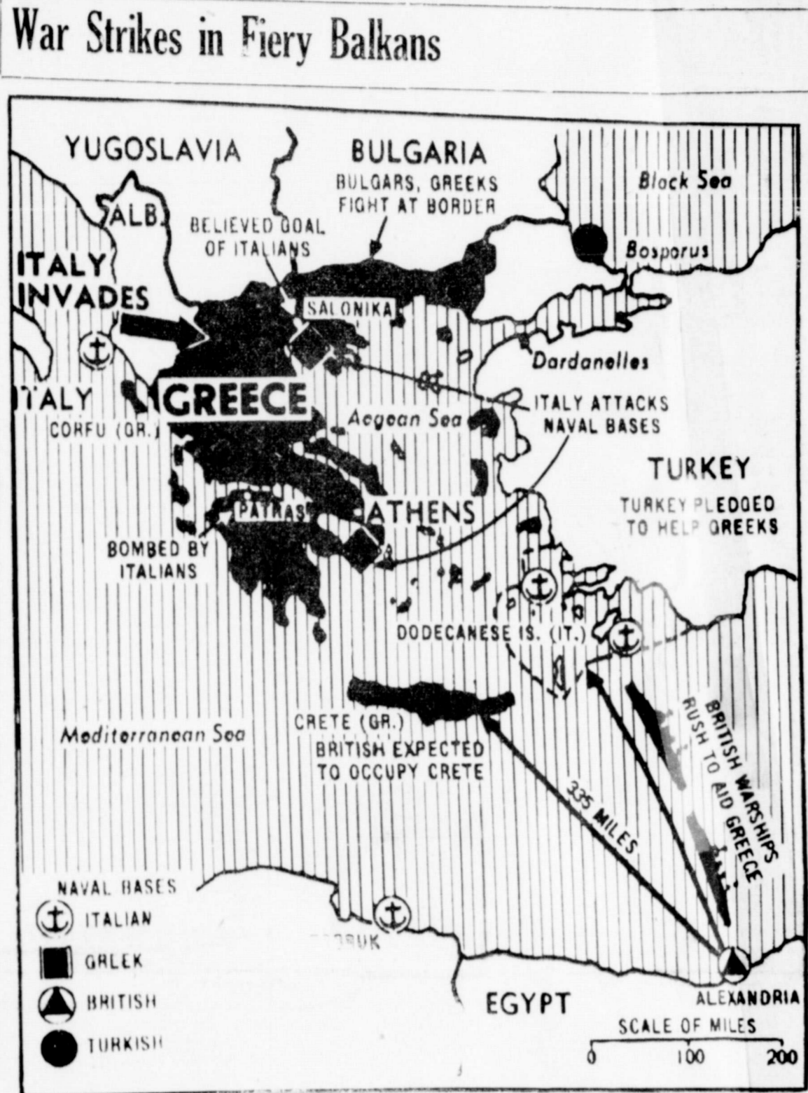
The above telephotoed map shows the Balkan war situation at a glance after Italian troops moved across the Greek-Albanian border. Air bases, including those at Athens and Salonika were bombed by Italian planes as British rushed planes and warships to the aid of her Balkan ally.

Italy invades Greece... British warships rush to aid Greece... Turkey reported to be moving forces to border... The above telephotoed map shows the Balkan war situation at a glance after Italian troops moved across the Greek-Albanian border. Air bases, including those at Athens and Salonika were bombed by Italian planes as British rushed planes and warships to the aid of her Balkan ally.