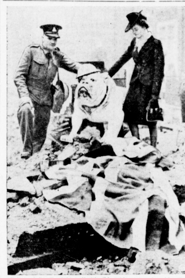
"Britain defiant" might well title this tableau, posed amidst the debris of a London street after a Nazi raid. Helmeted bulldog, symbol of British determination, stands guard over the Union Jack. The dog was removed from London shop window that was blasted out by bombs.