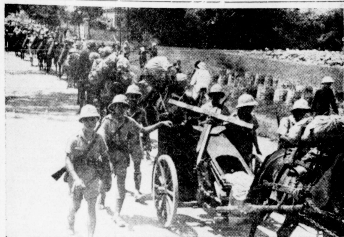
Annamite troops who stood guard while Japs landed near Do-Son in French Indo-China, march back to their garrisons at Haiphong after being ordered not to resist the Japanese invasion which was allowed under a Vichy-Tokyo accord.