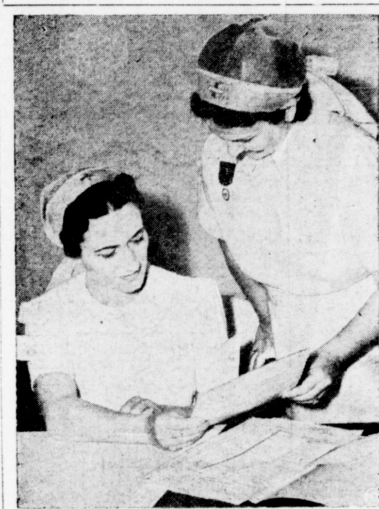
The Duchess of Windsor has often set the pace of world fashion with her varied and chic outfits. But this, her newest attire, is practical rather than chic and is as old as nursing itself. She's pictured in Nassau, where, as president of the Bahamas Red Cross, she's hard at work aiding the British Empire war effort.