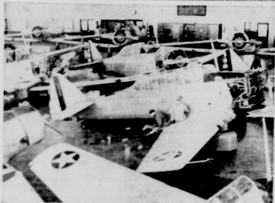
The biplane flying over London during the night, "West Point of the Air," are carefully checked and processed before being put to bed for the night. The problem of conserving every minute of flying time for the military effort, 7,000 of whom are to be trained this year. Republic largely on the ground forces, the "winning weapon" of Uncle Sam's aerial force.