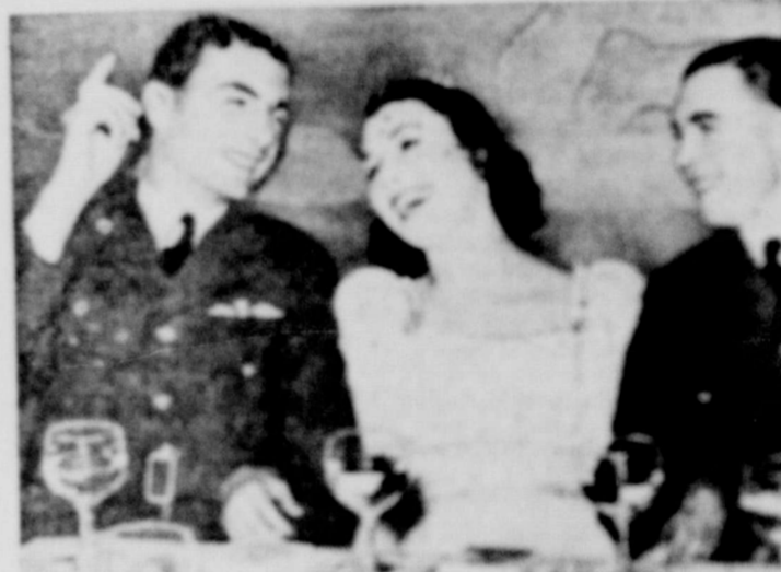
Two E. A. F. officers join Miss Ward, American ambassador in a bit of post-banquet of a London night club. British women emphasize London's gay night life, despite curfew and rationing.