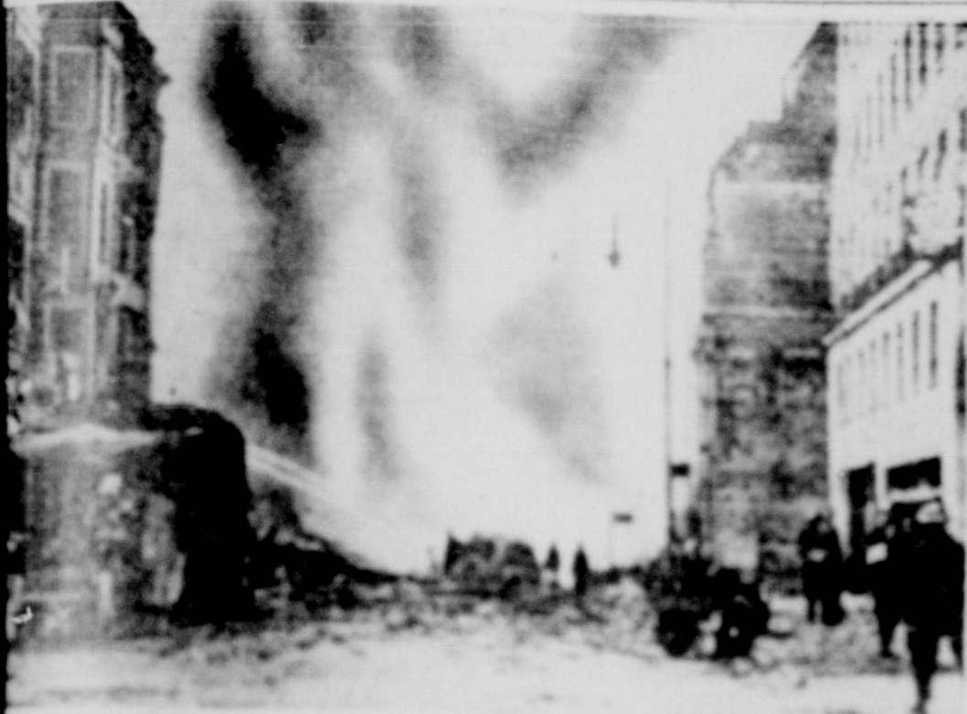
After the London attack and during the night, the background shows the aftermath of the deadliest attack of the war, killing 4,000 people.