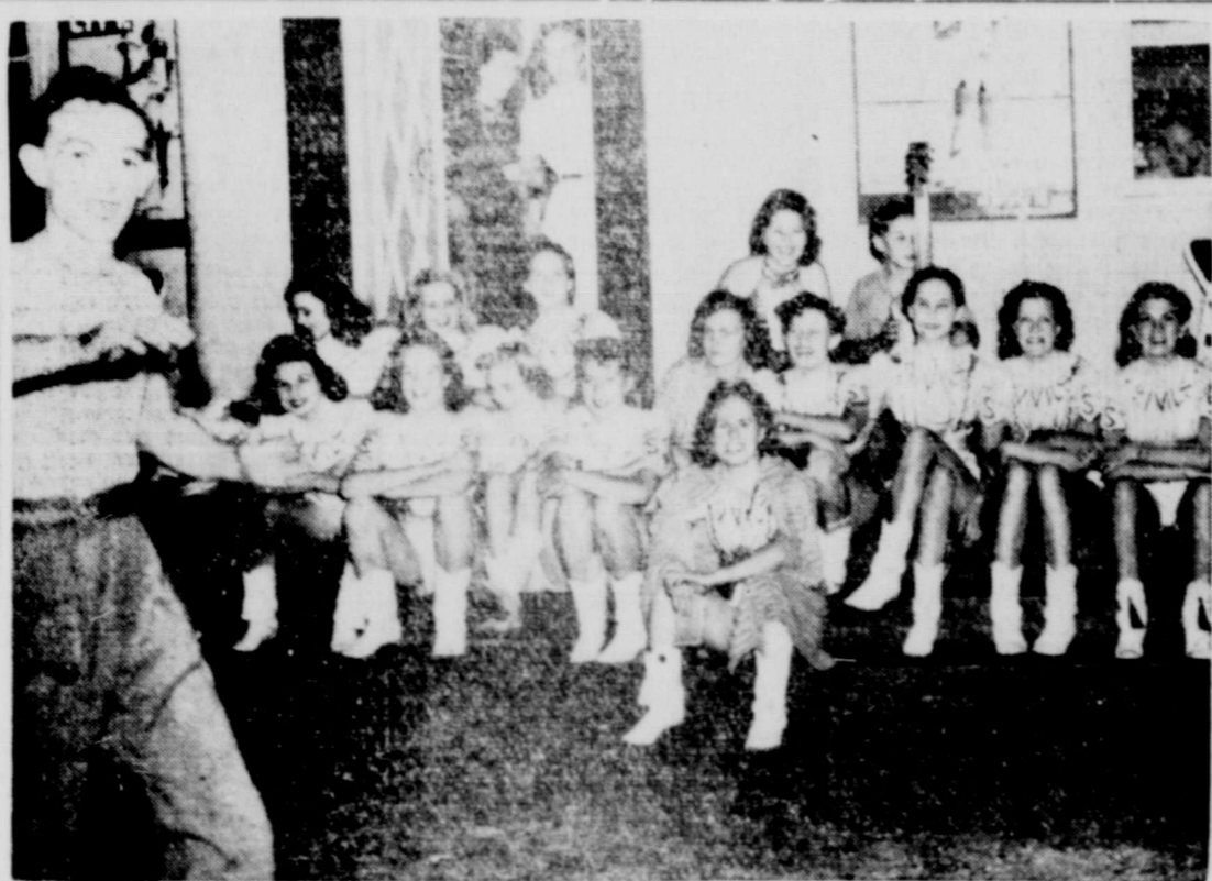
Dallas "cigarettes" refuse to work as another drive-in employee, in left foreground, tries to stop photographers. Girls later fought among themselves, and with reporters and photographers, smashing cameras and pictures before police quieted them down.