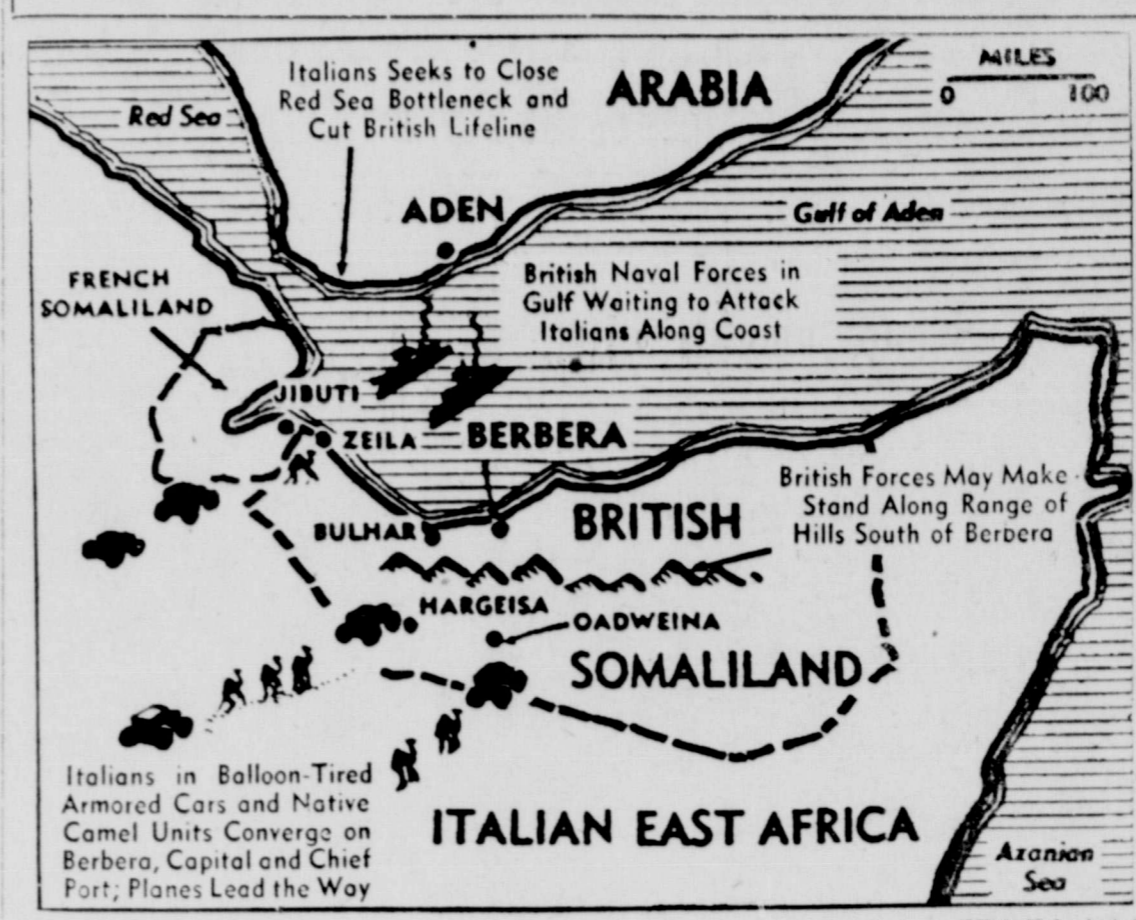
Today's War Map is an animated view of the North African front where Italian troops, utilizing varied land, sea and air forces, steadily pushed back the British troops.