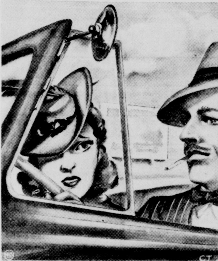
"You're just a glamor girl with a roto-glamour complex," Dick told her.

CHAPTER II THERE was a split second that was horror for that small group of people, Georgette, Dick Douglas, Bob Davis, and Anne.