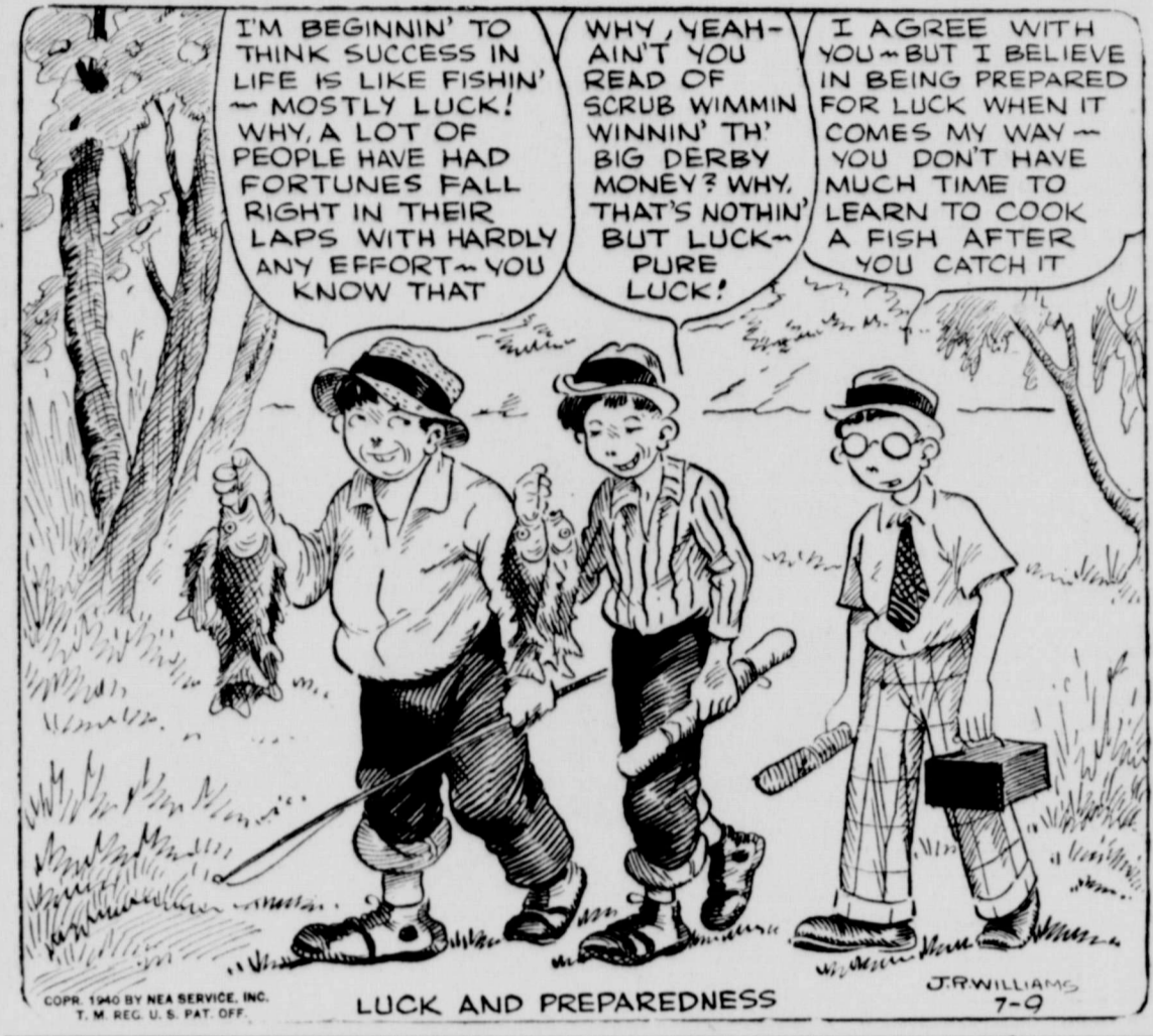
LUCK AND PREPAREDNESS