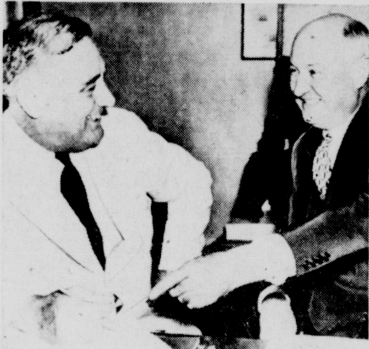
Whatever FDR told Jim Farley about his third-term aims at their Hyde Park conference is going to remain a secret according to the postmaster general. The president and his political manager are shown before the doors were locked on their secret session.