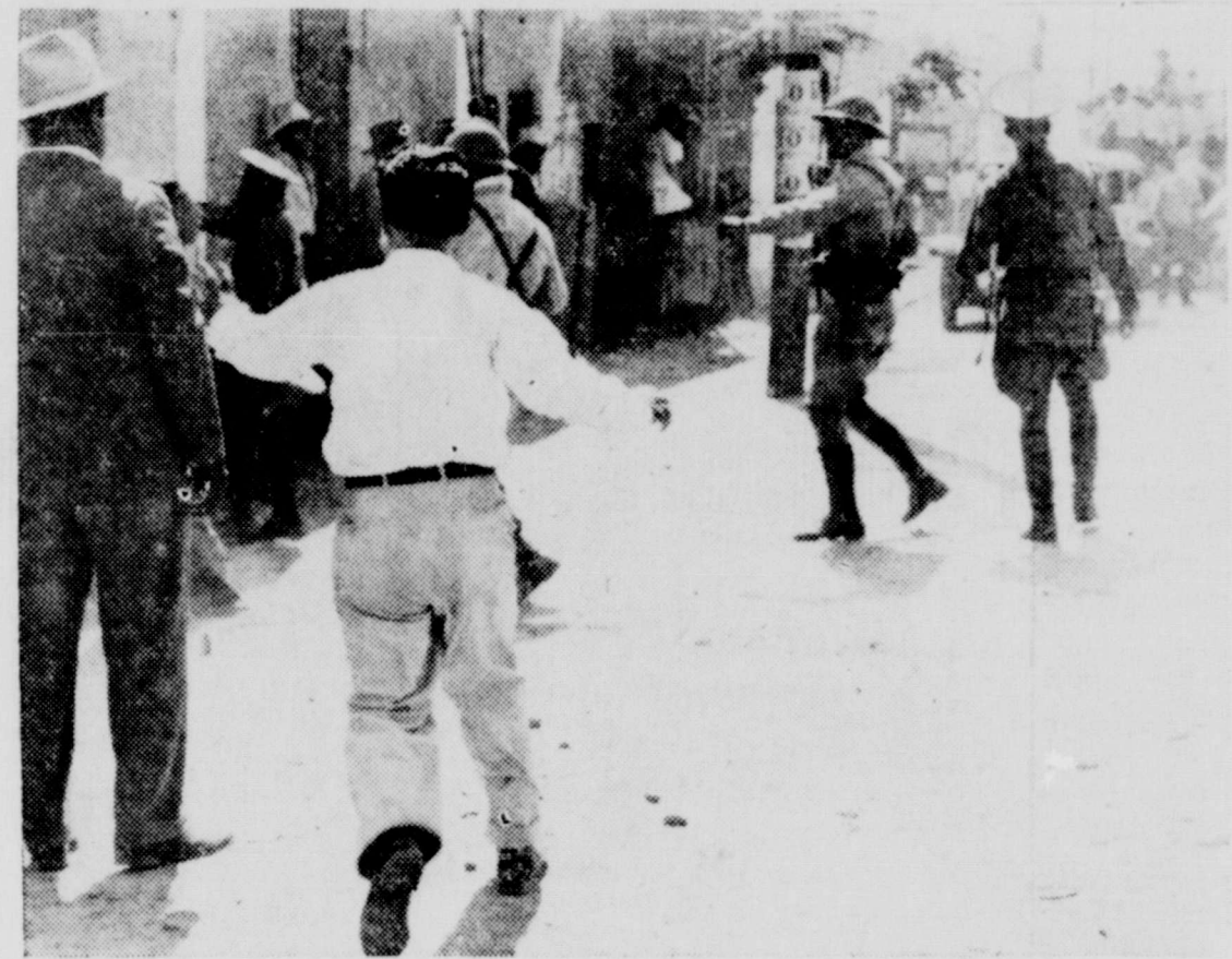
Mexican police quickly quell an election riot at Juarez, Mexico, after Camacho party members, shown in right background in trucks, descended on a polling place in a flying column to install members of their group as voting officials. Balloting went on without further disturbance after police fixed bayonets to rifles and forced the crowd to disperse. Deaths of 48 persons have been confirmed and over 400 injured reported in hottest political fight in Mexican history.