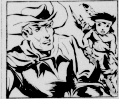
Red Ryder and Little Beaver as Fred Harman draws them.