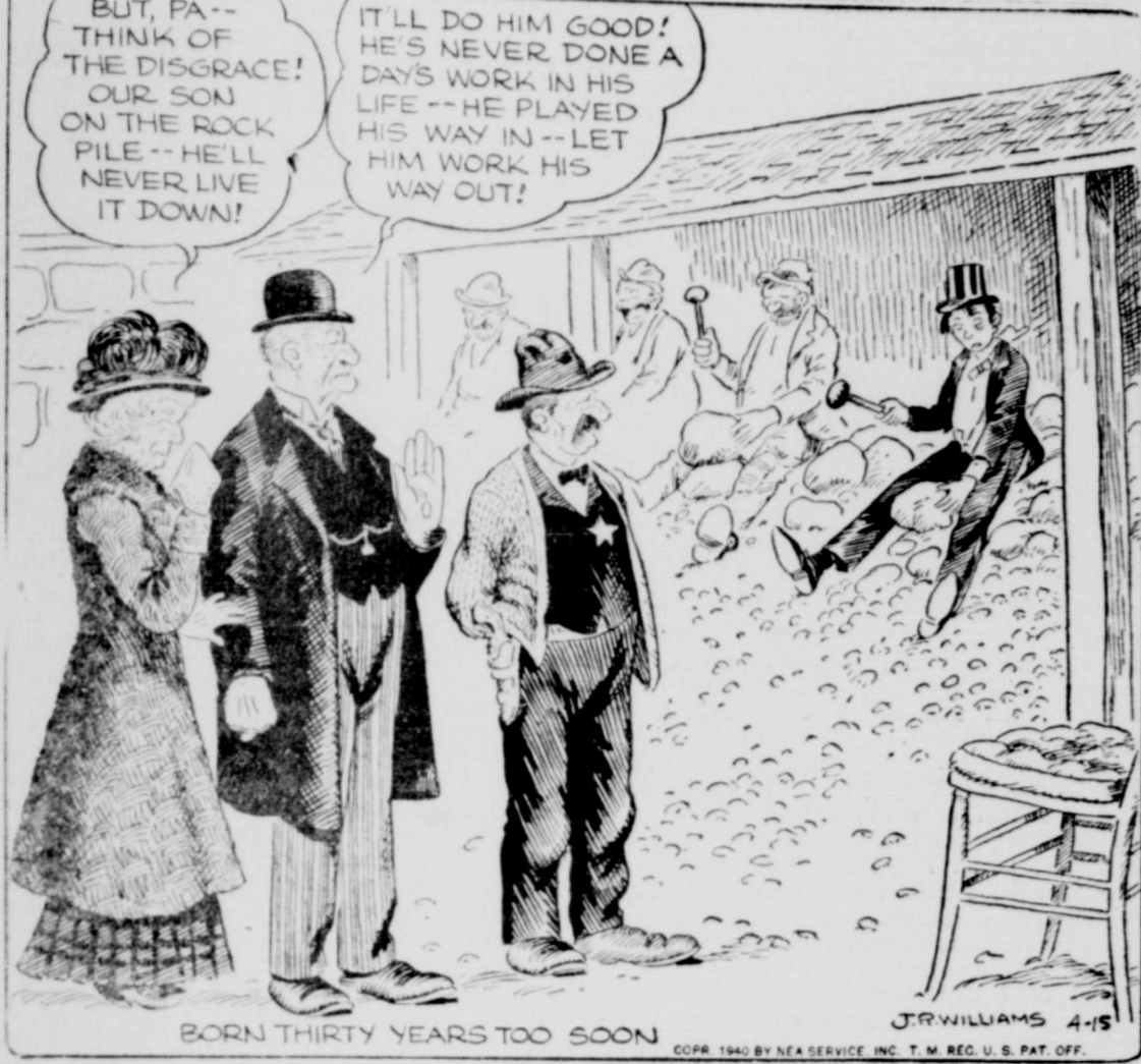
BORN THIRTY YEARS TOO SOON