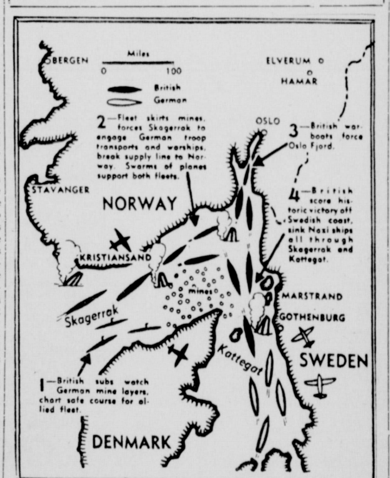
Latest developments in the European naval battles are shown in the above map rushed to this paper by telephoto.