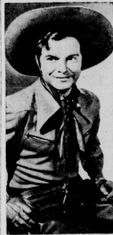
Don Barry as Red Ryder

No successful western series is what you would call revolutionary in pattern. "Red Ryder" will be remarkable for three things: The fat budget, a seldom-equalled $250,000; its costly and elaborate