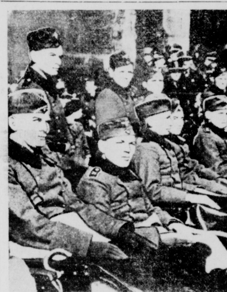
Heroes' Day in Germany was marked by a visit from Adolf Hitler to wounded German soldiers at the Berlin Zeuhaus. The picture was passed by British censor.