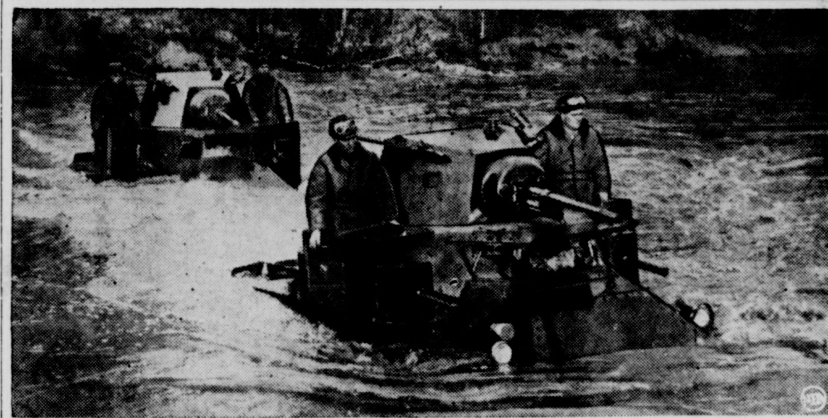
Real "land batleships" are these amphibians of the U. S. Army Tank Corps. With guns bristling from main side turrets, and others astern, the tanks ford a stream nearly five feet deep during recent war games at Fort Benning, Ga.