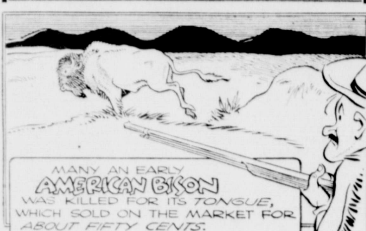
MANY AN EARLY AMERICAN BISON WAS KILLED FOR ITS TONGUE, WHICH SOLD ON THE MARKET FOR ABOUT FIFTY CENTS.