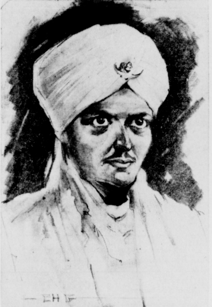
Chandra's gleaming eyes stared out from the portrait on Christine's easel.

When, after 15 minutes, no customers appeared, Christine suggested, "Nothing draws a crowd like the sight of someone working at an easel..."