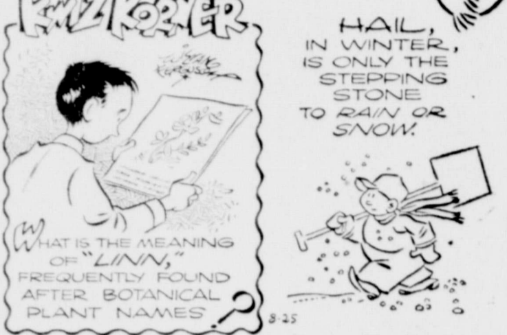
ANSWER: It is an abbreviation of Linnaeus, famous Swedish botanist and authority for thousands of plant names, and founder of our present system of plant naming.