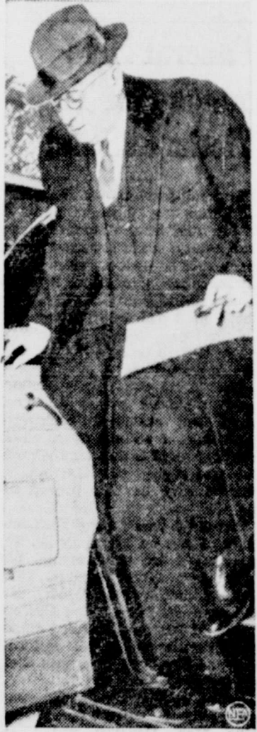
The retiring attorney general arrives at White House for his last cabinet meeting.