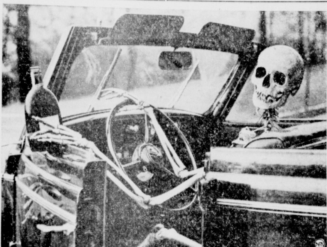
Liquor and Death... boon companions of the highway... traffic's unbeatable team... don't try to beat them... it can't be done. Any time you're inclined to think you can get away with drinking at the wheel, take a look at this grim warning and have another think.