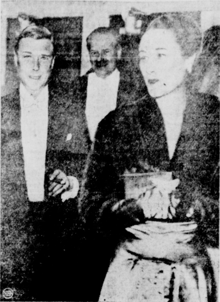
'What are the Duke and Duchess of Windsor doing these days? Well, for one thing they're going to the movies just like other folk. The duke, cigar in hand and smiling, is pictured with his lady, arriving for a Danielle Darrieux premiere at a Paris theater.

doches, Navarro, Palo Pinto, Panola, Parker, Polk, Potter, Randall, Roberts, Robertson, Shackelford, Stephens, Taylor, Throckmorton, Wilson and Wood. Counties having no open season on deer this year are: Anderson, Armstrong, Bastrop, Bowie, Burleson, Brazos, Briscoe, Brown, Cass, Callahan, Childress, Coleman, Coke, Coryell, Erath, Eastland, Fanning, Freestone, Galveston, Grimes, Haskell, Harrison, Hemp-