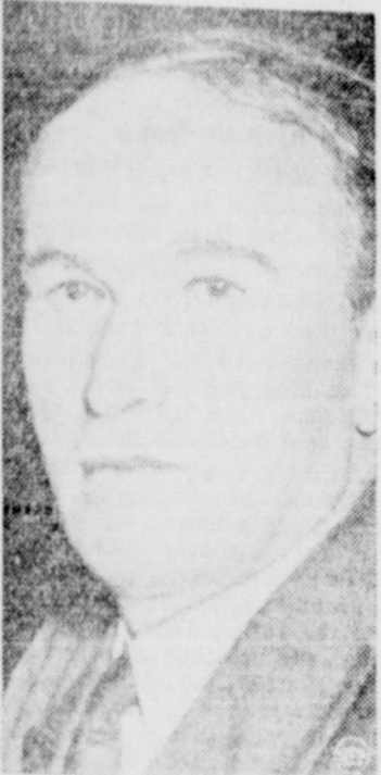
Federal Judge William Clark, above, of Newark, N. J., who in 1930 jumped into the news with a revolutionary legal opinion that the 18th Amendment was invalid, again has made headlines with a 15,000-word opinion forbidding Mayor Frank Hague of Newark from interfering with C. I. O. distribution of leaflets, union organization and public meetings.