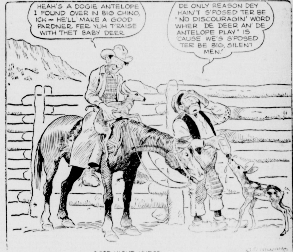
GOOD NIGHT, NURSE