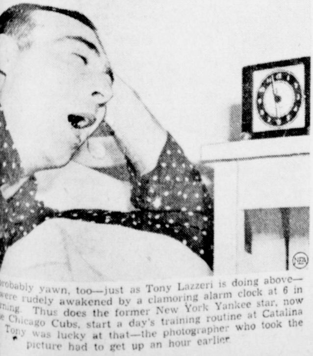
Probably yawn, too—just as Tony Lazzeri is doing above—were rudely awakened by a clanging alarm clock at 6 in morning. Thus does the former New York Yankee star, now the Chicago Cubs, start a day's training routine at Catalina. Tony was lucky at that—the photographer who took the picture had to get up an hour earlier.