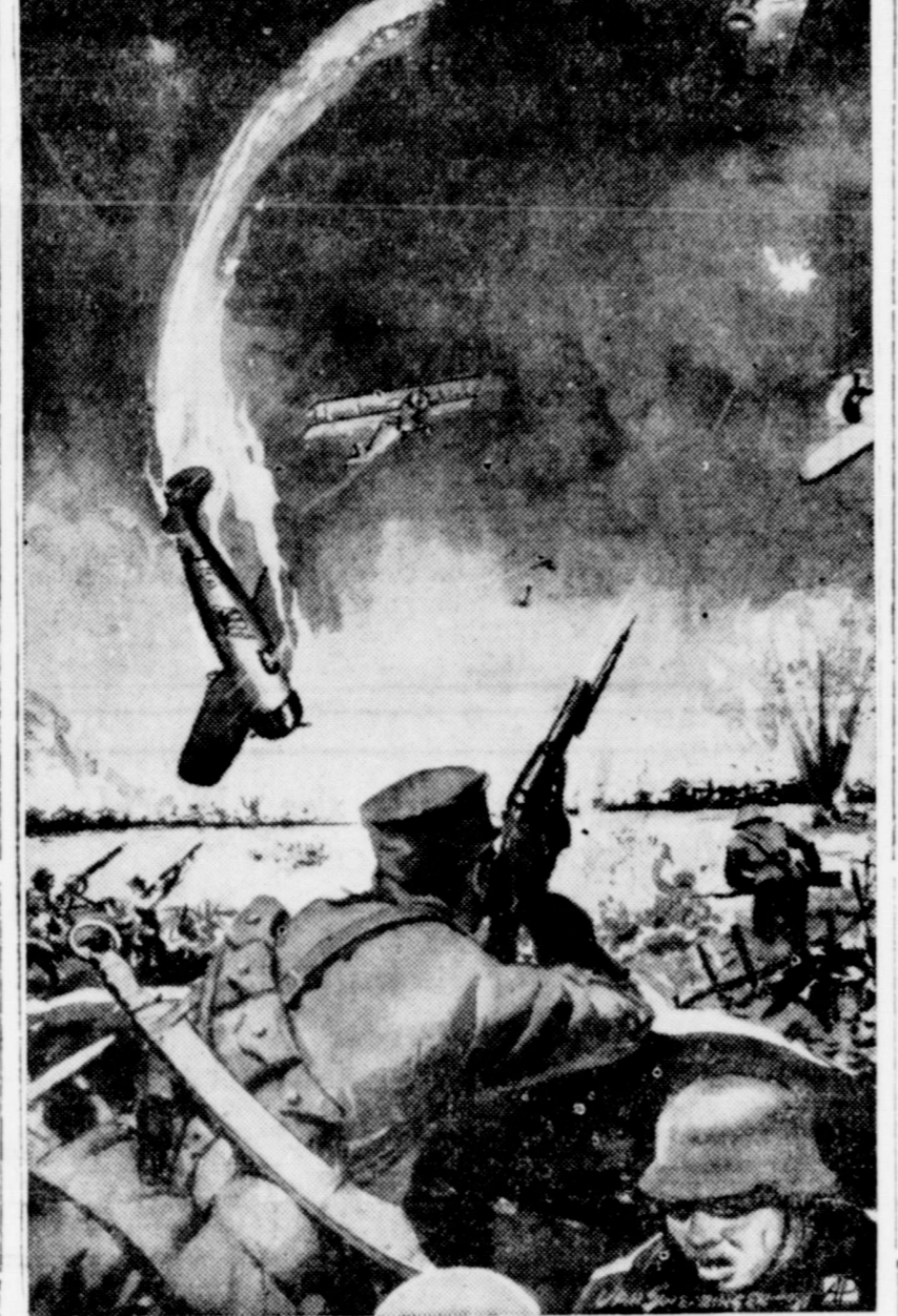
HUMAN BOMB An artist's conception of the suicide plunge of a Japanese aviator who rode his disabled bomber into the Chinese lines and perished in the explosion of its deadly load.