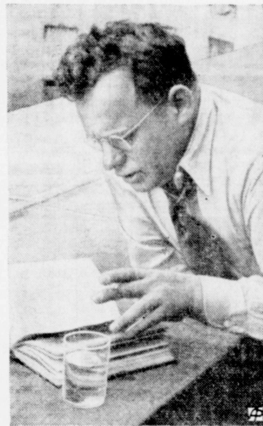
4. WORK DONE, he reads on the balcony.