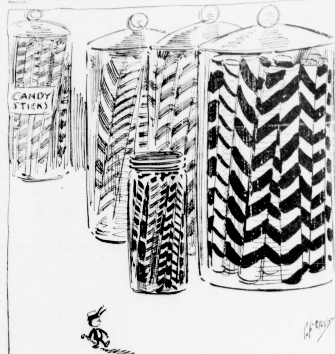
Mr Bug: "I never saw such a town—All Barber Shops."