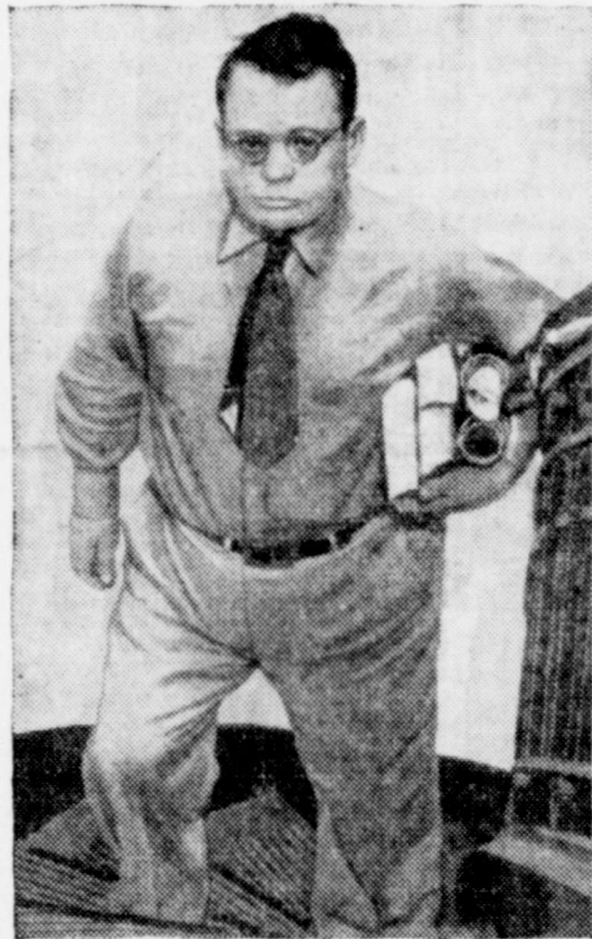
2. BY SECRET STAIRS he goes to his den.