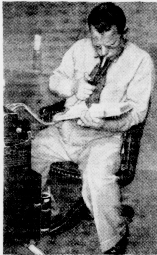
3. IN COMFORT he dictates a speech.