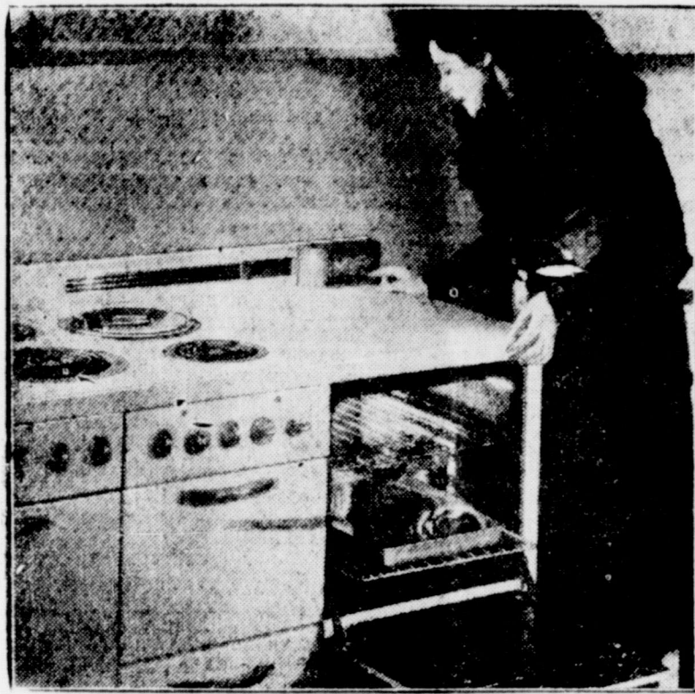
The modern homemaker lets the timer-clock of her electric range direct the cooking of delicious even meals.