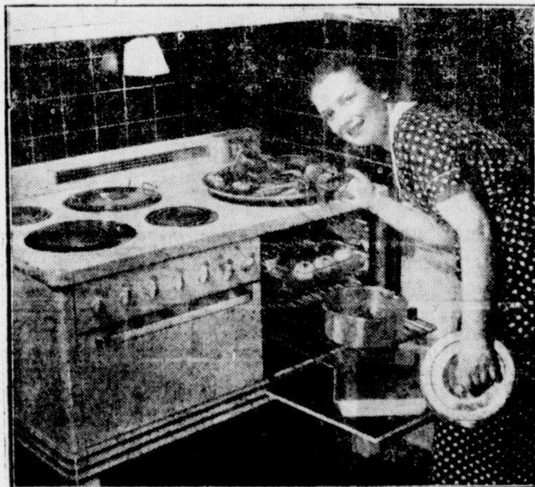
Thirty-minute oven meals, such as this, are the gift of the modern electric range.