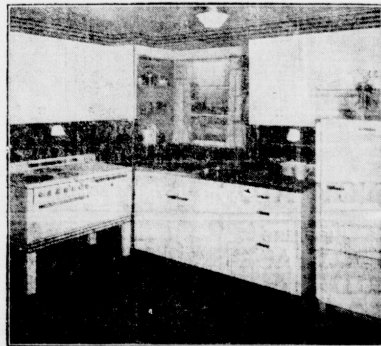
The electric range, at left, is one of the most important features of the modern all-electric kitchen.