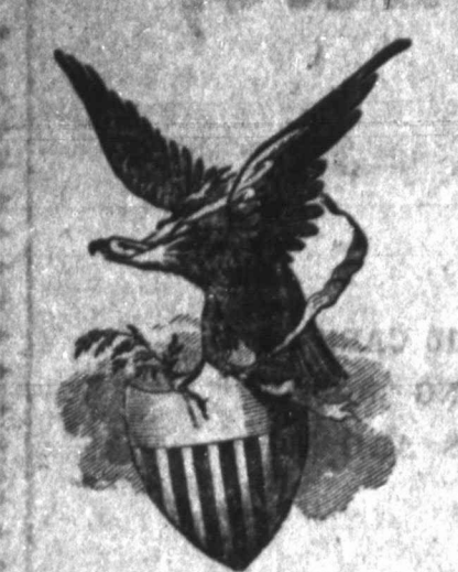
DEMOCRATIC IN POLITICS

Foreign Advertising Representative IE AMERICAN PRESS ASSOCIATION