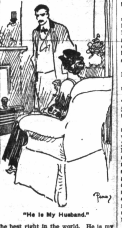
"He is My Husband."