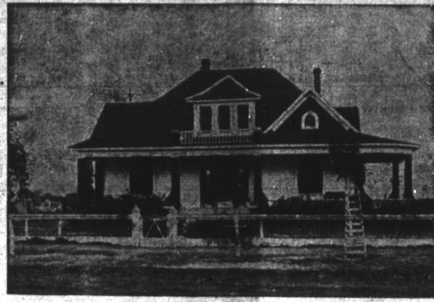
One of Portales' Palatial Homes.