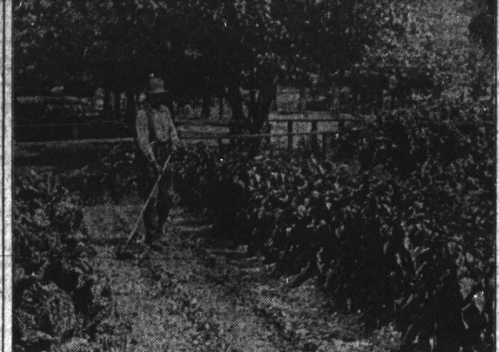
Making the Best of the Replanting Season—Hoeing His Second Crop of Snap Beans.