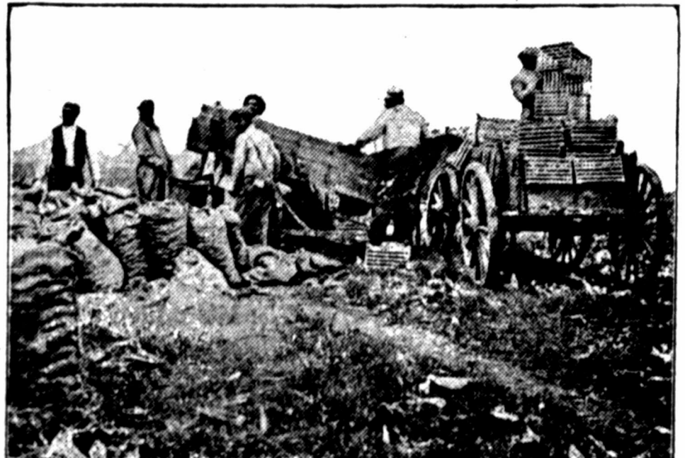
Graded Produce Sells for High Prices on Any Market.

The bureau of markets has recommended grades for potatoes. Bermuda