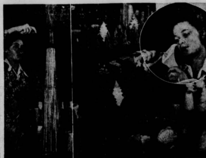
Christmas candles can take many shapes and forms, many may be made at home, or purchased on the market, to suit the decorative effect desired.