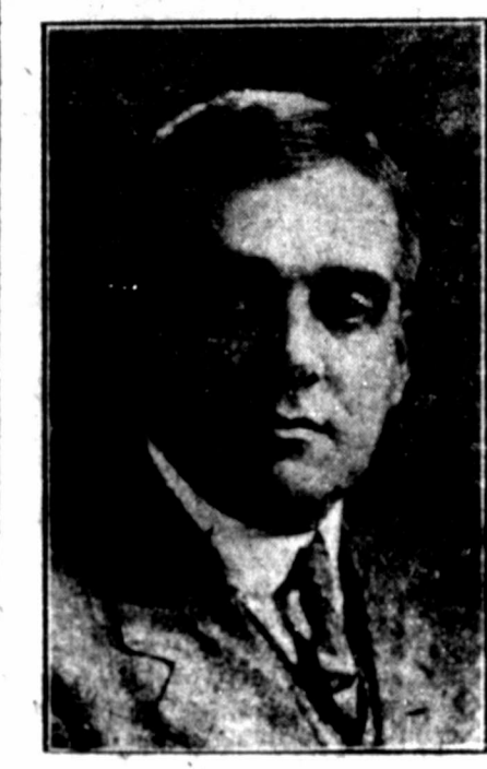
Heed the Urgent Call of President U. S. Senator.

News want ads bring results. | mass at 9:30 a. m.