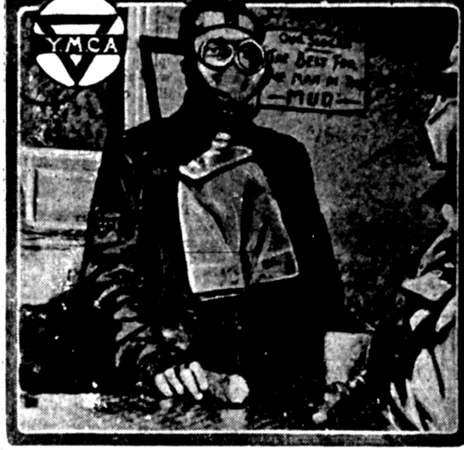
Gas masks are indespensable articles near the front. This Y. M. C. A. canteen manager has been forced to don his "muzzle," but he is still holding his position behind the counter. He was later wounded while on duty. Y. M. C. A. men at the front not only see that the boys are furnished

refreshments, but they often help in the care of the wounded. Several Red Triangle workers have been wounded by shell and gas, while a number have lost their lives in this service. The sign just over the "Y" man's shoulder reads: "Our Slogan-Best for the Man in the Mud."