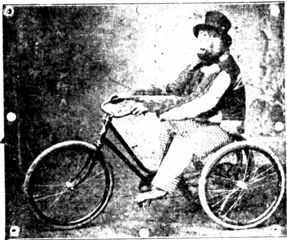
Joe, One of the Forty Performing Monkeys That Cut Capers in Barnes' Circus, Coming Saturday, October 13th.

Al G. Barnes' Wild Animal Circus Will Be In Portales On Saturday, October 13th