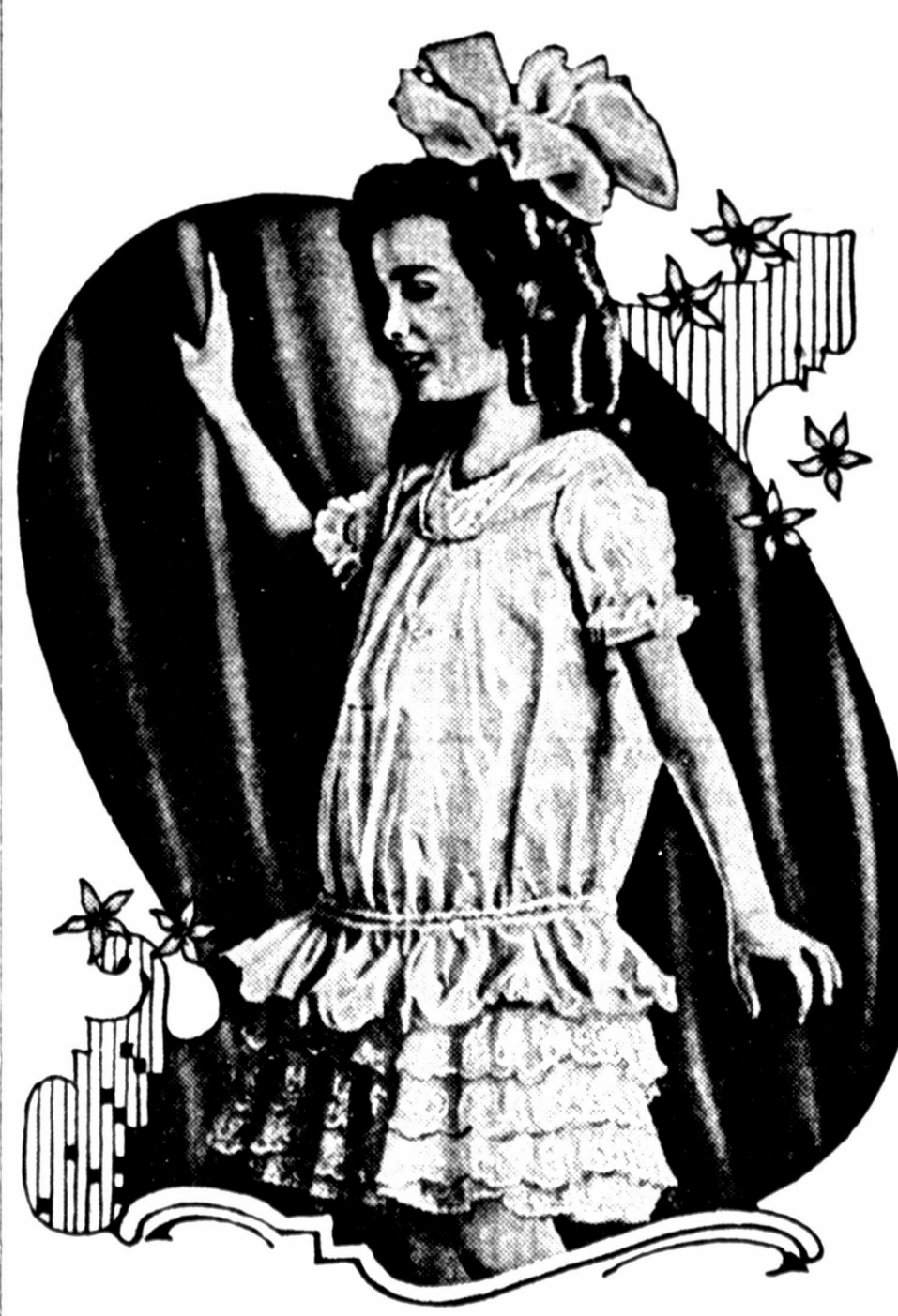
PARTY FROCK FOR THE SMALL MAID.

and well-liked lines, shows a finish en- | narrow straps over the shoulder and tirely novel. All its edges are fin-scalloped about the bottom. The scalished with a piping of white and out- lops are bound with a narrow binding teresting. lined with narrow flat silk braid, mak- of taffeta made from strips cut on the ing the sharp and snappy contrast of bias. The silk is shirred over a cord black and white in a conservative about the neck, and the arm's eye and fashion. It has a "chin-chin" collar. shoulder straps are bound like the and Foot The short coat of covert cloth scallops. The fullness of the silk is trimmed with plain broadcioth is drawn in about the hips with two frankly a model for all-round wear, shirrings over cable cord, forming a Diseases and does not commit itself to any sort | sprightly flounce below. The overof special occasion. It is pictured dress slips on over the head. As worn with an afternoon frock of taf- pictured, it is made of light blue shing taffeta with considerable stiffness.