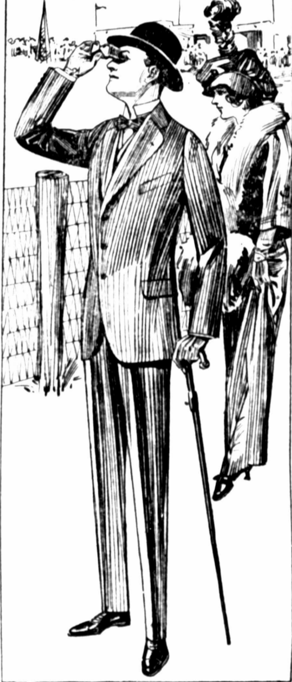
SCHLOSS BALTIMORE CLOTHES

are now in stock and you'll find these clothes as different from ordinary clothes as this year's styles are from those of last season. Why not get the best? They cost no more. Also, our Walk-Over Shoes for Fall in all the new lasts. We are headquarters for boys clothing, hats and caps. Don't fail to see our new fall Stetson hats, all the new styles. Call and see us.