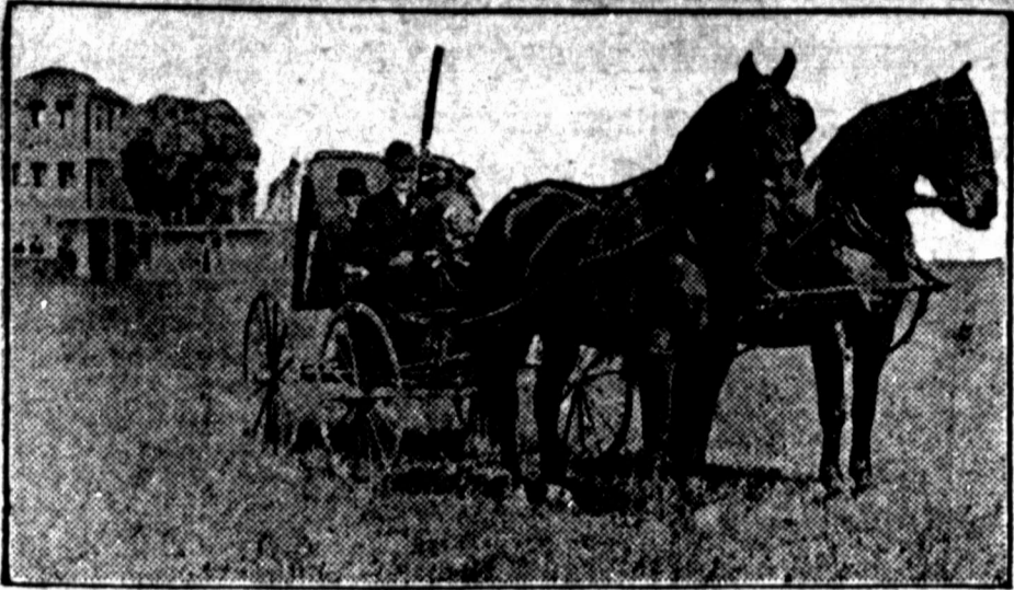
Family-Broke Driving Horse is Necessity on Every Farm.