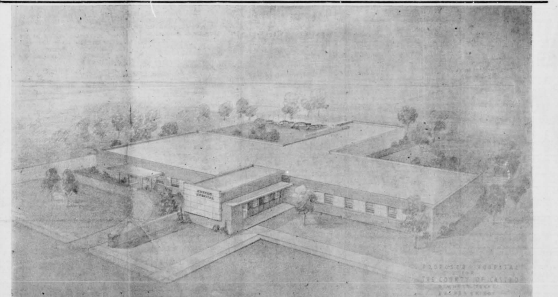
OUTSIDE VIEW —Here is the architect's drawing of the exterior of the proposed Castro County Hospital if tentative plans are adopted and the election votes favorably on July 9th. The commissioners court accepted the plans Monday to give county voters more information so they could better determine how they want to vote. The small section, jutting toward the lower left corner, is the lobby and will face due south. West of this lobby portion is the operating room, emergency room, laboratories, x-ray rooms and maternity patient rooms. The wing facing north contains, among other things, the kitchen, laundry, storage and dining rooms. The east wing is all general patient rooms. The tentative floor plan will be presented next week in the News.

THIRTY THIRD YEAR DIMMITT, CASTRO COUNTY, TEXAS, THURSDAY, JUNE 30, 1960 12 PAGES—NUMBER 36