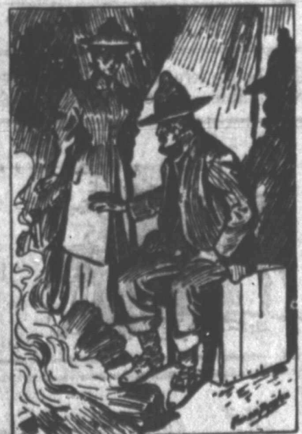
"Alone in the Rain"

Marlon laughed—a troubled little laugh of surprise and sadness. "Dear, he isn't pitiless at all. He has unpleasant things to do, and does them. He is the man on whom the railroad relies to repress the lawlessness that breaks out in the mountains at times and interferes with the operating of the road. It frightens people away, and prevents others from coming in to settle. Railroads want law and order. Robbery and murders don't make business for railroads. They depend on settlers for developing a country, don't you know; otherwise they would have no traffic, not to speak of wanting their trains and men left alone. When Mr. Bucks undertook to open up this country to settlers, he needed a man of patience and endurance and with courage and