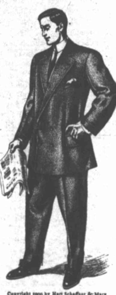
Copyright 1909 by Hart Schaffner & Marx

We have decided to stay and continue our business in Portales. We will move into the new brick building next door to Warren-Fooshee & Company, as soon as it is completed, which will be about July 1st, and from now until we move we will sell out all of our goods that we have, so that when we get located in our new building we will have nothing but new goods. We will sell better goods for less money than we have ever sold before in Portales. We will have something special every day from now until we move, so don't fail to see us when you're in town.